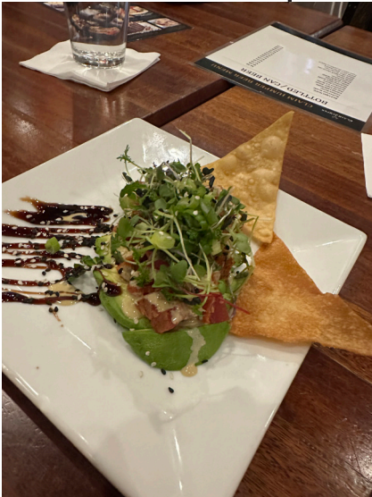
One of the Claim Jumper menu items