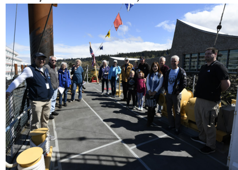
JOCO members joined the last tour group of the day aboard the "Columbia."