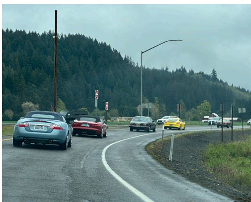
April 11, the Astoria Caravan turns off US 26 (west) to Oregon 47 toward Vernonia