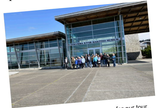
Just before we entered the museum for our tour.