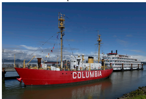
Lightship "Columbia" in all its glory moored at the "peerless" Columbia River Maritime Museum in Astoria.

Being as this is Oregon and being as this is April, one would expect that driving something other than your bog-standard everyday grocery getter would be foolhardy to say the least, especially when the destination of said trip is Astoria on the coast.