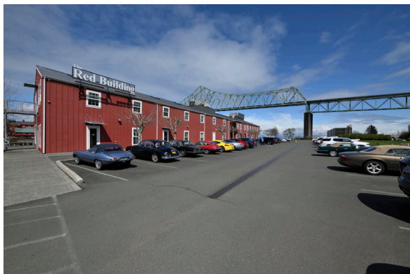
The "Red Building" that houses the Bridgewater Bistro on the east end. One of the building's former tenants was a marine engine overhaul shop.