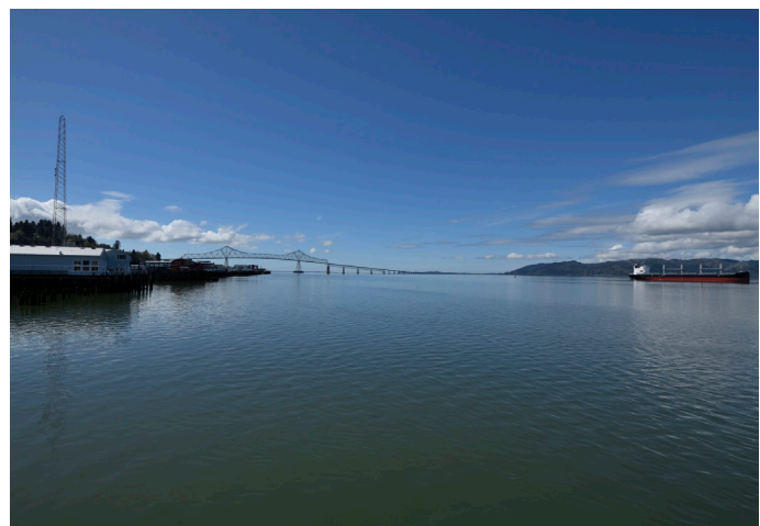
Columbia River, Astoria-Megler bridge, and an anchored freighter waiting to take on cargo upriver at one of the terminals in Washington or Oregon