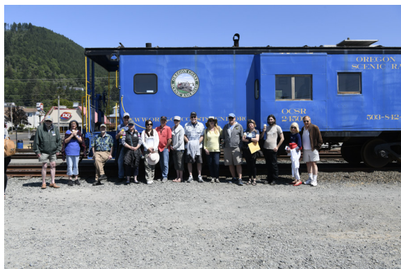
Get ready for a fun steam train ride on the Oregon Coast Scenic Railroad from Rockaway to Wheeler (and back) on May 2nd, and the Mustang Wranglers will join us..

Check out the plans for upcoming driving and social events in May and June. More things are being added all the time, so please check the JOCO website's calendar and events pages for the latest info. See you there!