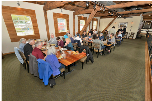
JOCO and SJC members had private seating at the Bridgewater Bistro where we could look out over some of the Columbia River during our meal.