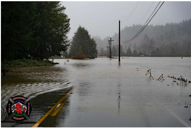
A couple of rainy days later the drive route was flooded out