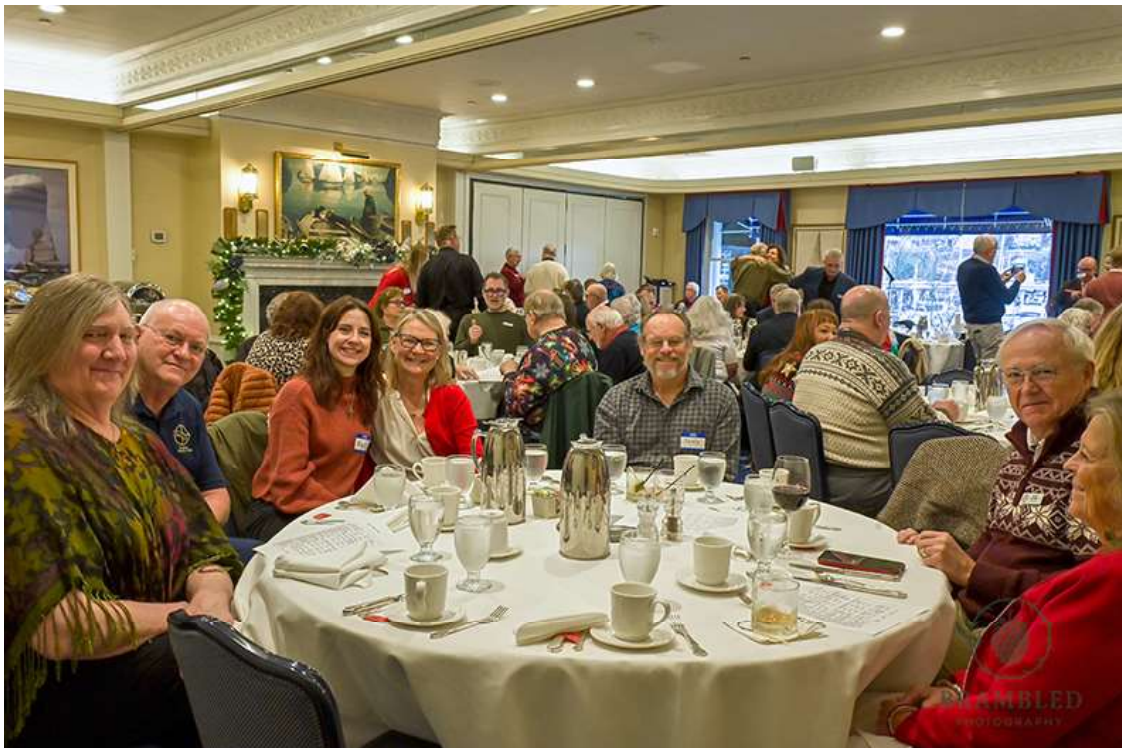
Photo from the 2025 Holiday Party

Sun Dec 13 Holiday Party. Details to come. Contact: sbcase253@hotmail.com 206.931.7795