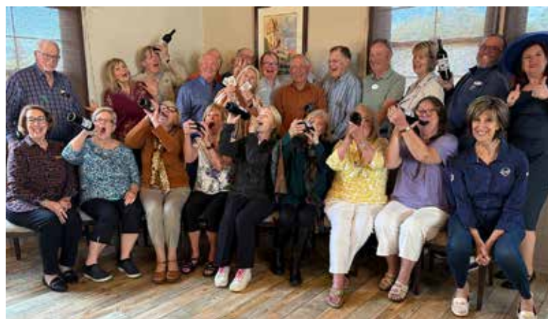
That was a Poker Rally for the history books.