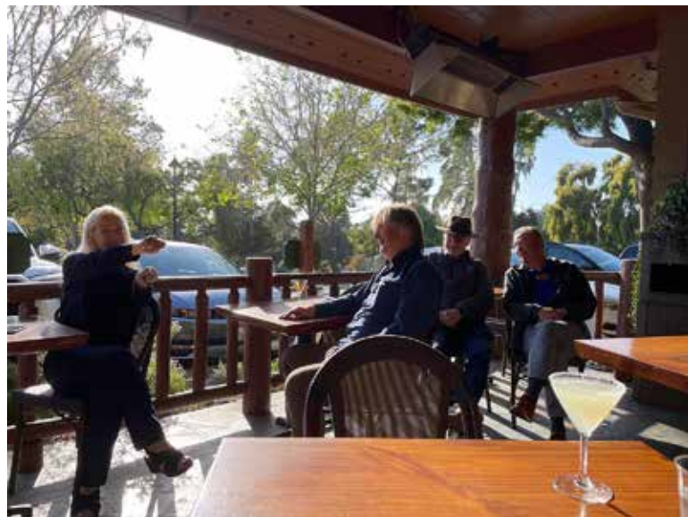
Kicking off an evening of fun.