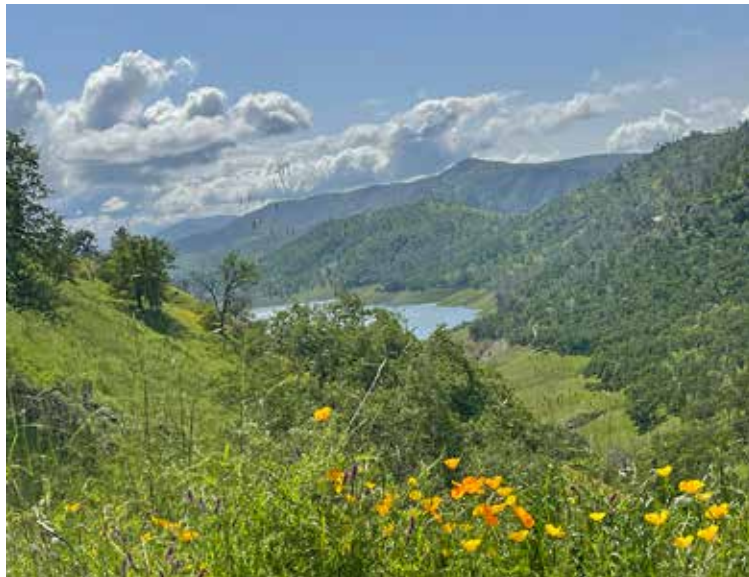
Beautiful spring drive.