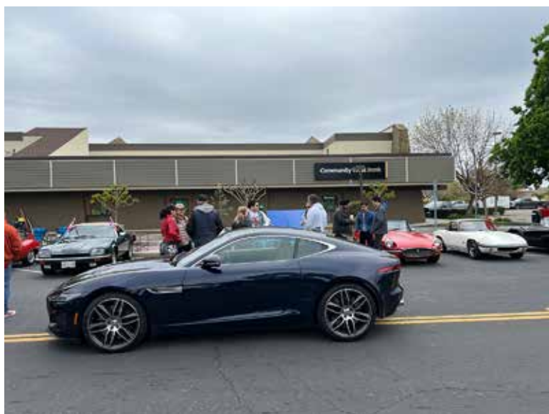
Blue making friends.