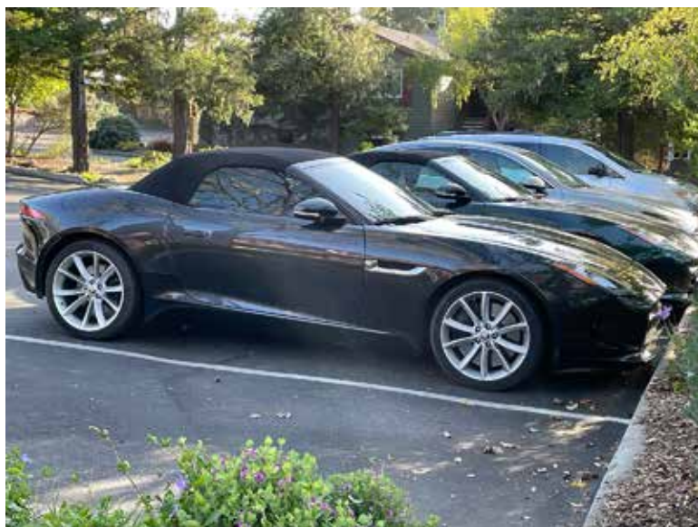
F for ferrrrrrocious.