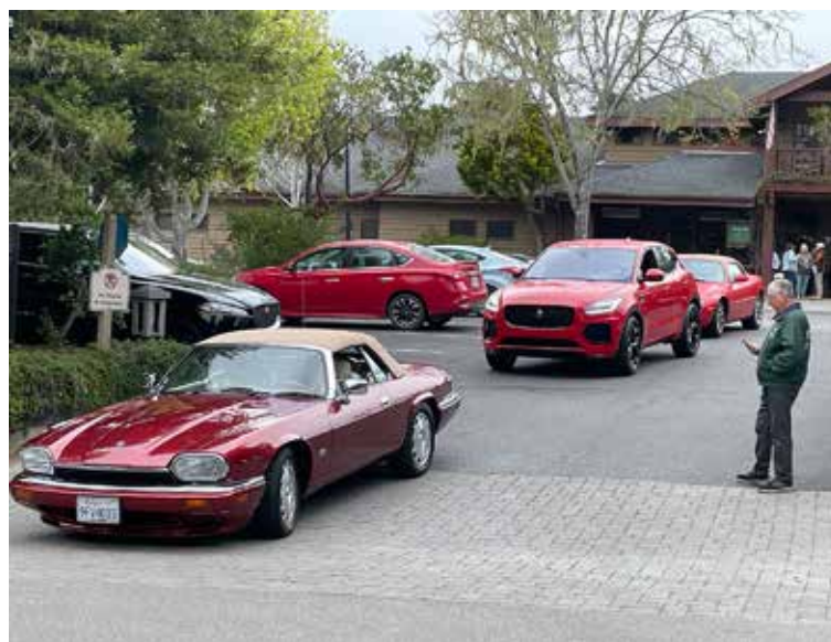
Waiting for the signal from Phil.