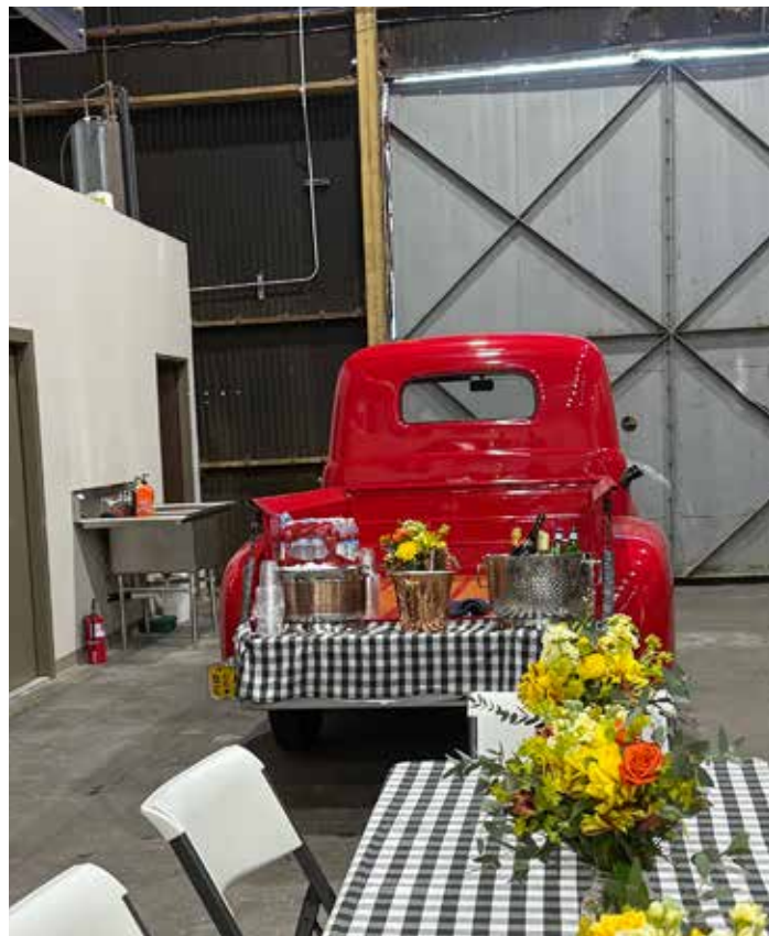
Wishing I had room to do this myself!