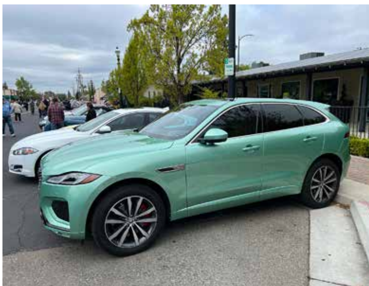
The Couch's new F-Pace.