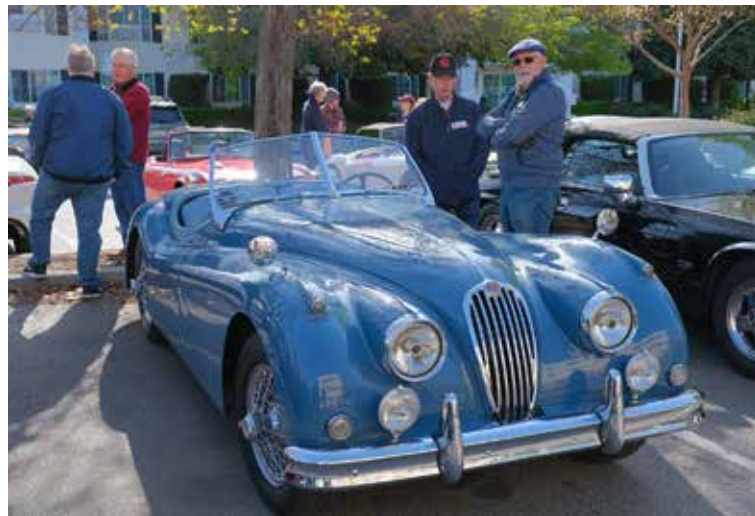
Baby Blue the winner of the President's Award.