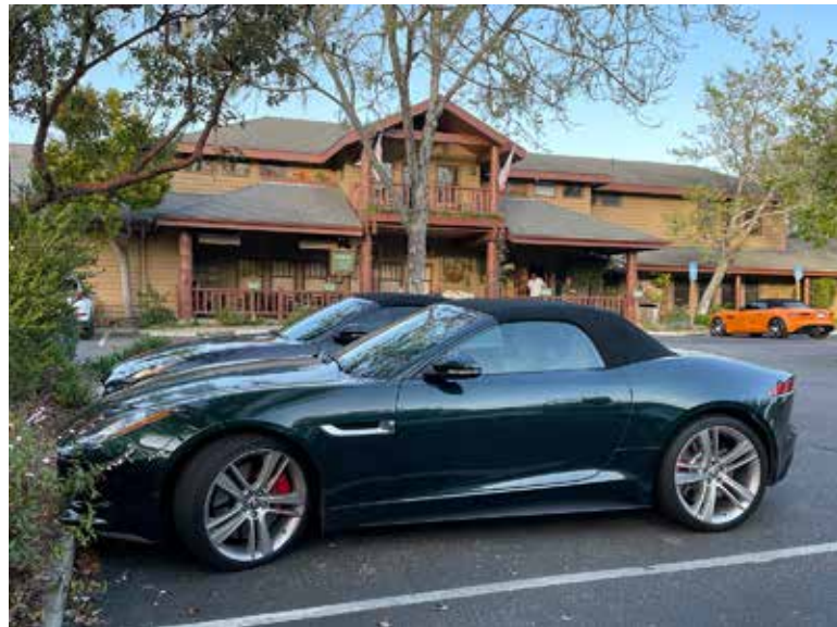
Can you hear this picture too.