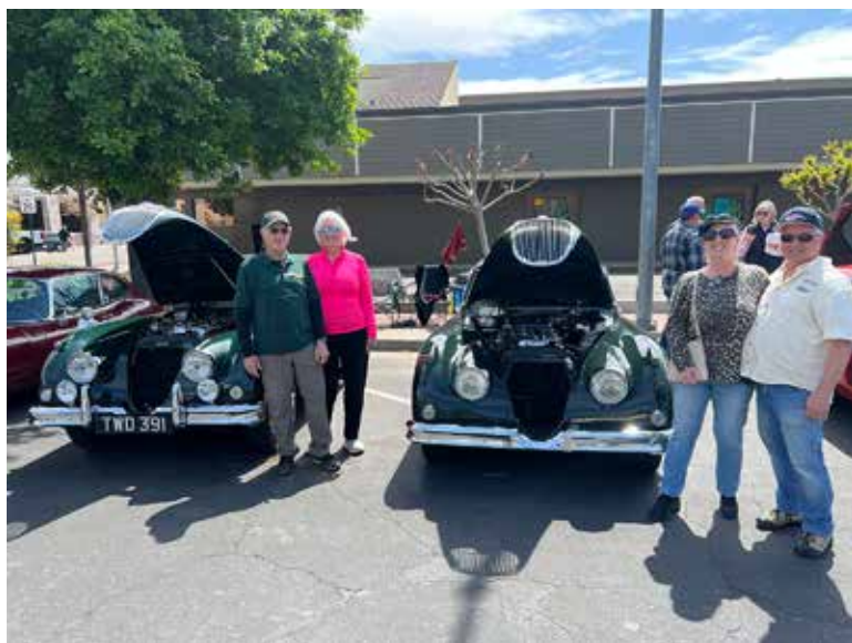
1958 meets 1961 while the rest of us drool over two XK150s.