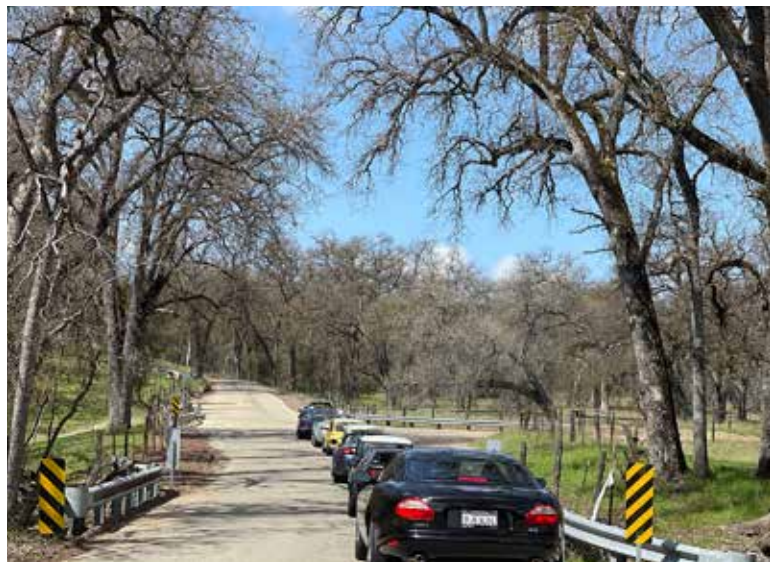
Ahhh, those are some beautiful driving buddies.