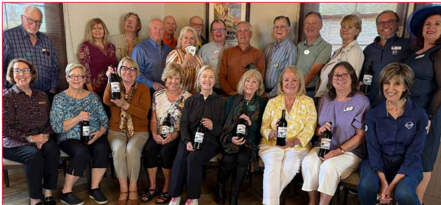
The best looking Poker Rally bunch ever!