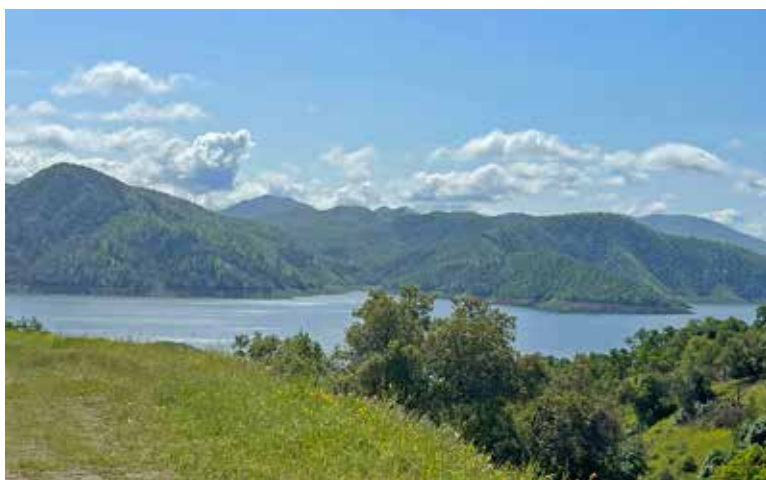
Loving that view.