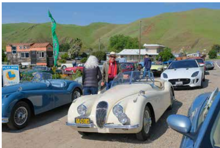
This may be the purrrettiest rest stop ever.