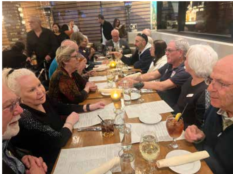
Dinner in Fresno.