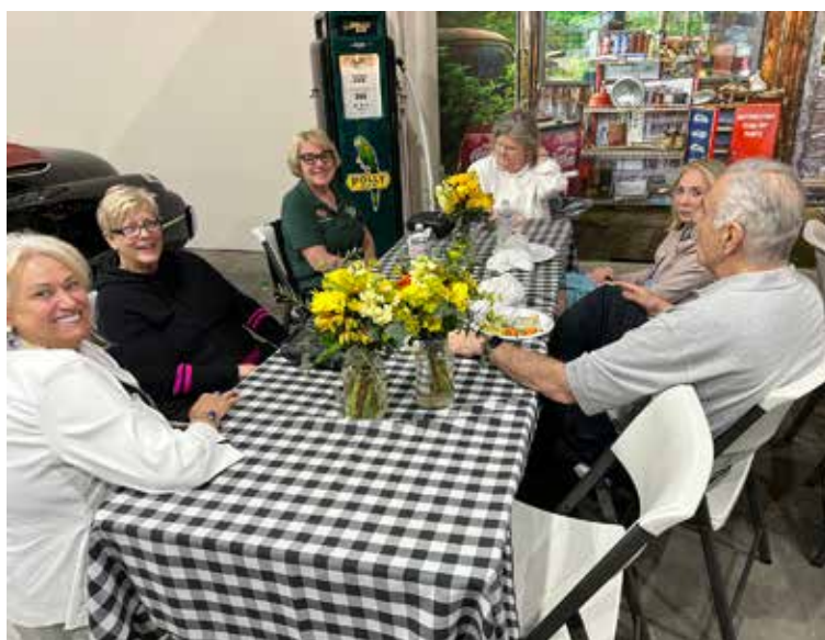
All smiles at the Rositano collection.