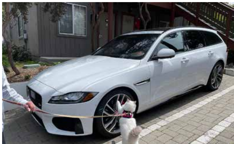
Sheepie the little cat saying hi to Spunky the big cat.