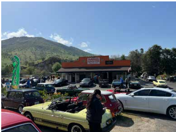
My kind of parking lot.