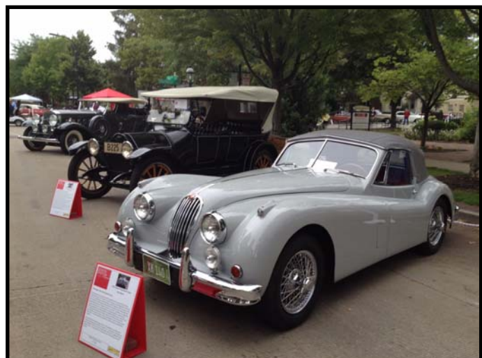
Phots from 2017 Geneva Concours