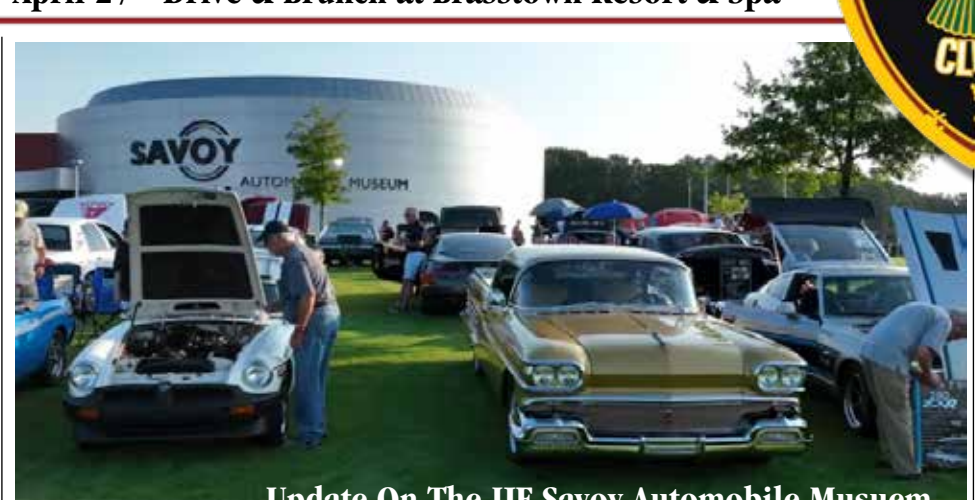
Update On The IJF Savoy Automobile Musuem Page 5