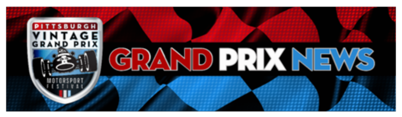
Two New Thrilling Race Tracks for the Grand Prix in Schenley Park!

The Pittsburgh Vintage Grand Prix is ready for racing action this summer! With the Panther Hollow Bridge closed for repairs, we're shifting gears and creating two thrilling new track events for the July 19-20 Vintage Weekend in Schenley Park.