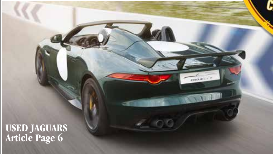
USED JAGUARS Article Page 6