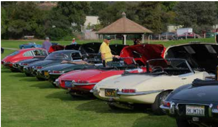
Some of my favorite butts.