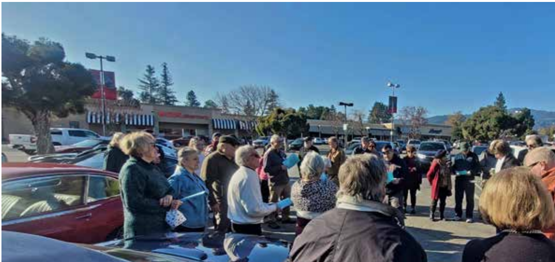
Driver's meeting.