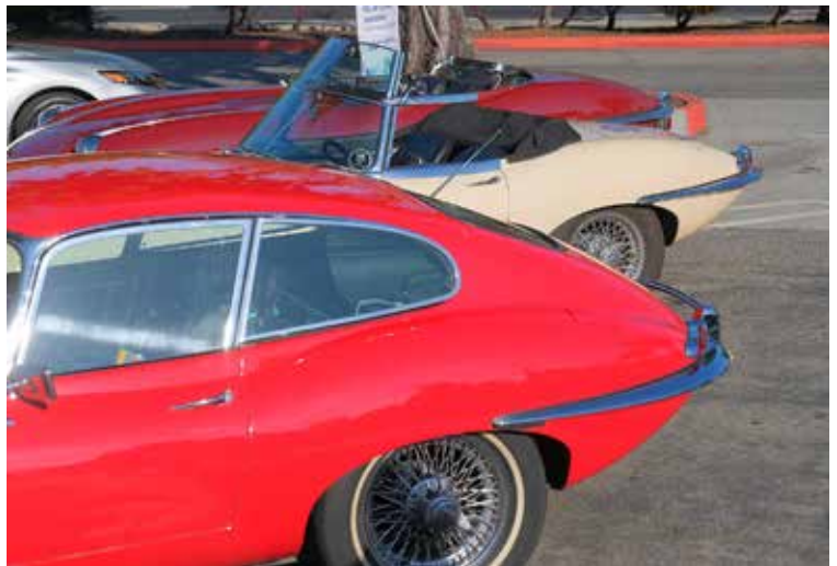
E is one of my favorite letters.