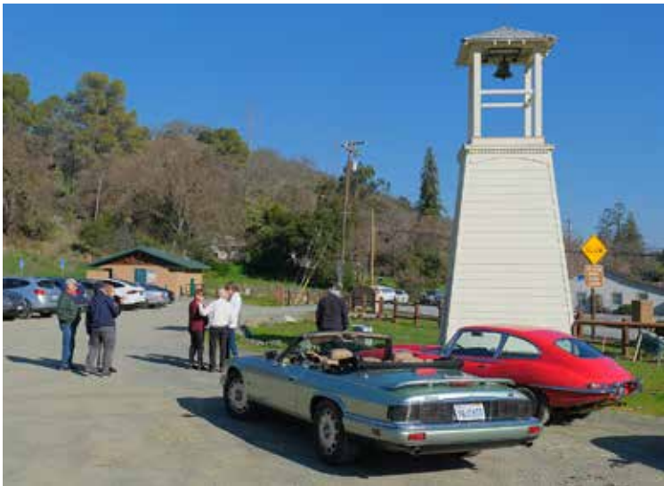
Grrrrreat day to have the cats out.