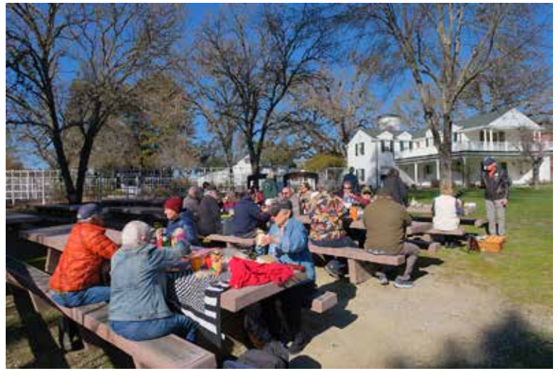
Picnic by the house.