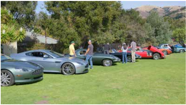
A nice British queue.