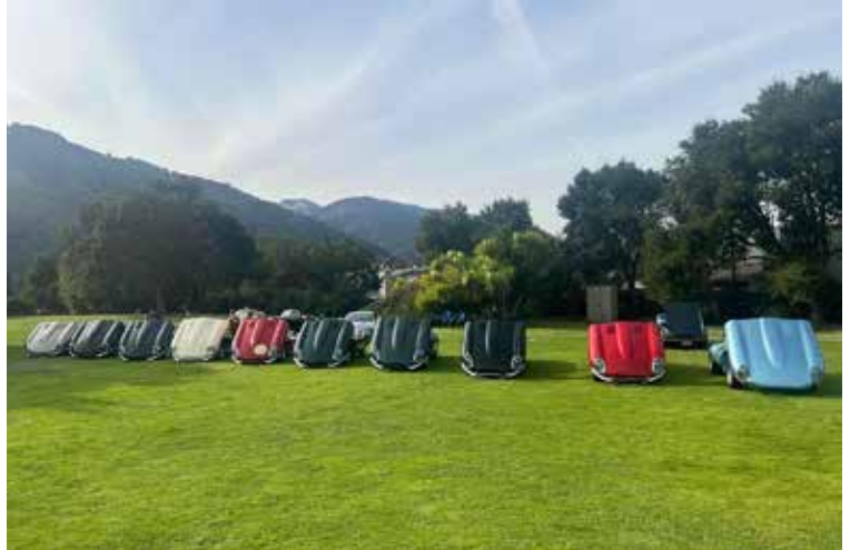
Bonnets up.