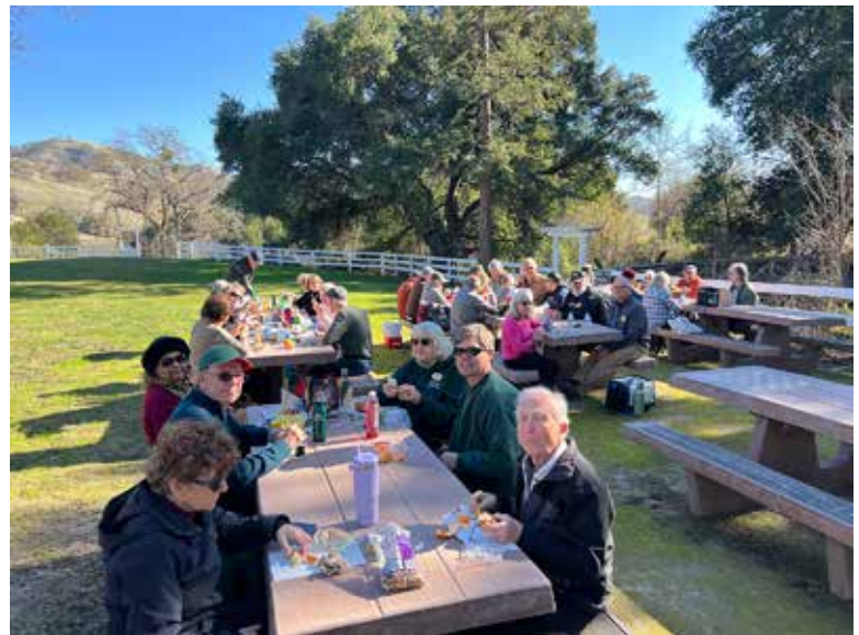
Mt Hamilton picninc.