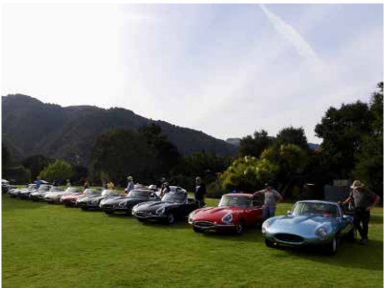
Excellent E lineup.