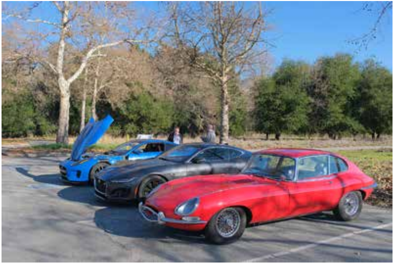
Beautiful history.