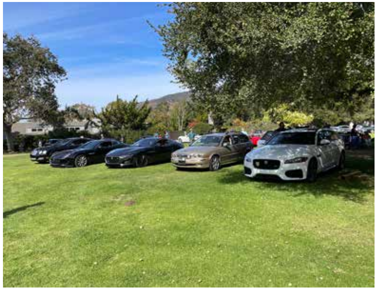
Modern, yet timeless.