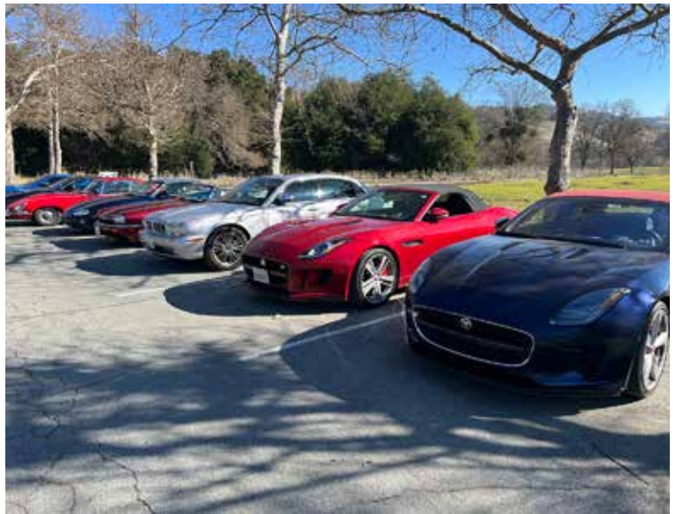
Mighty Purrrrrrrty.