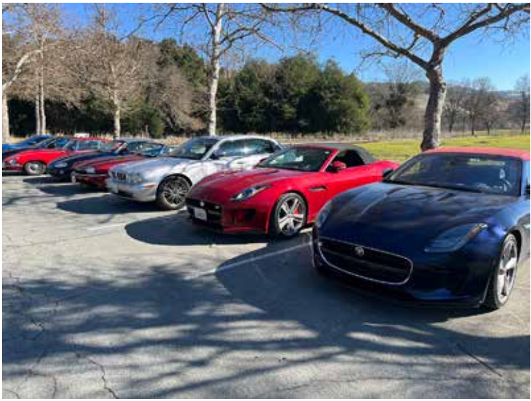
Mighty Purrrrrrrty.