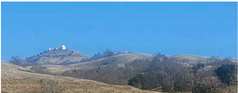
Mt Hamilton.