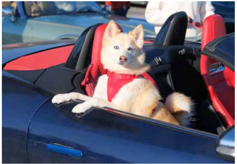
Lucky Gatsby.