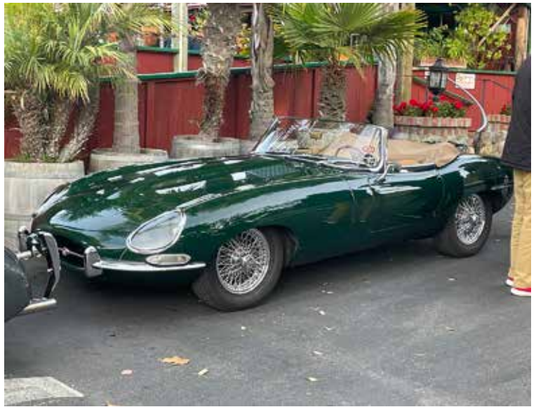
Absolutely Timeless.