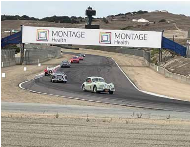
I could learn to follow racing.