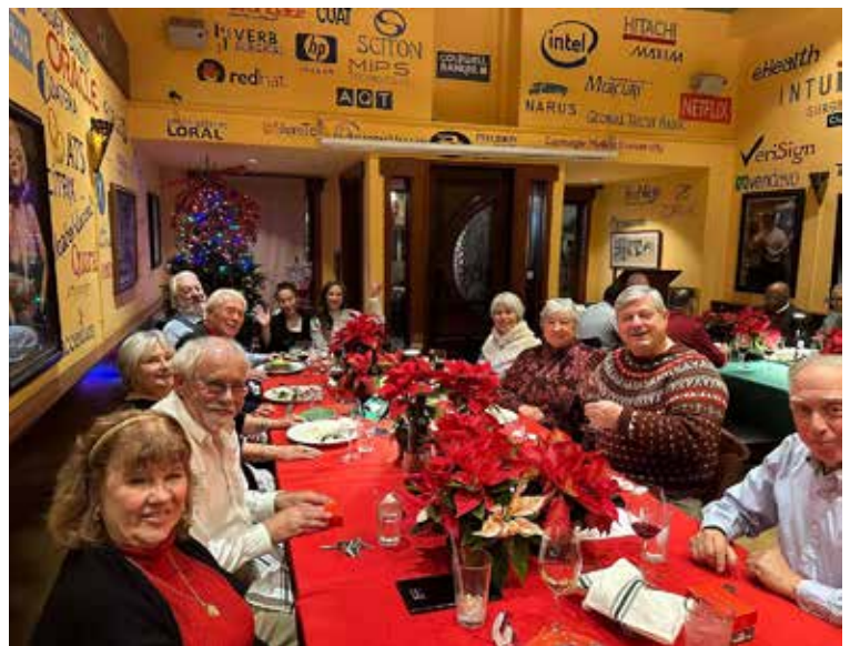
Holiday Partygoers.