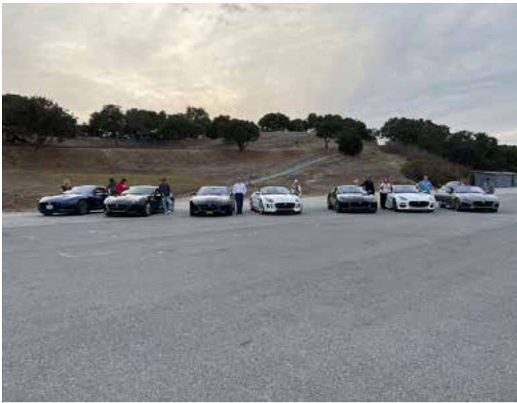
Fantastically ferocious looking bunch.