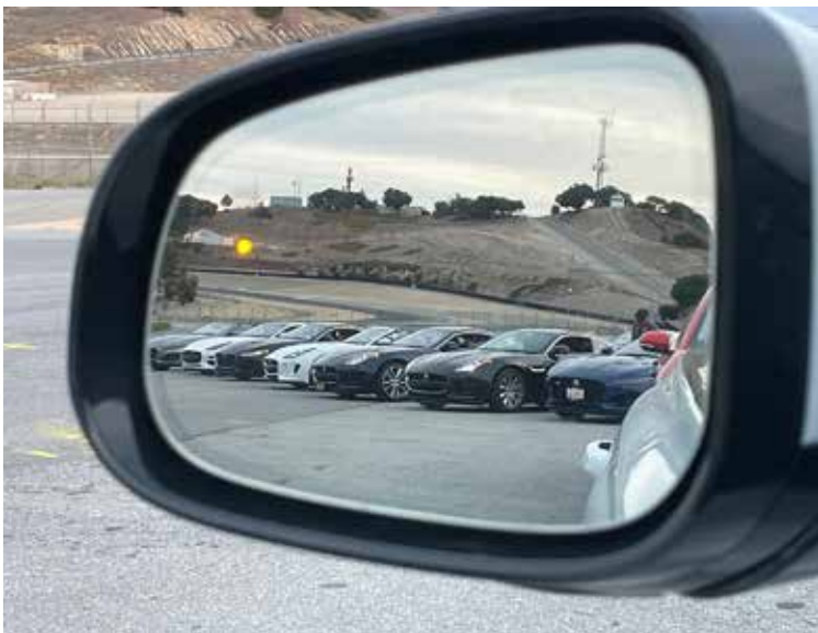
What a view.