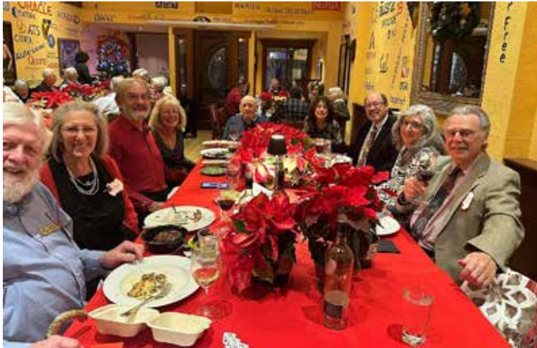
Holiday Partygoers.