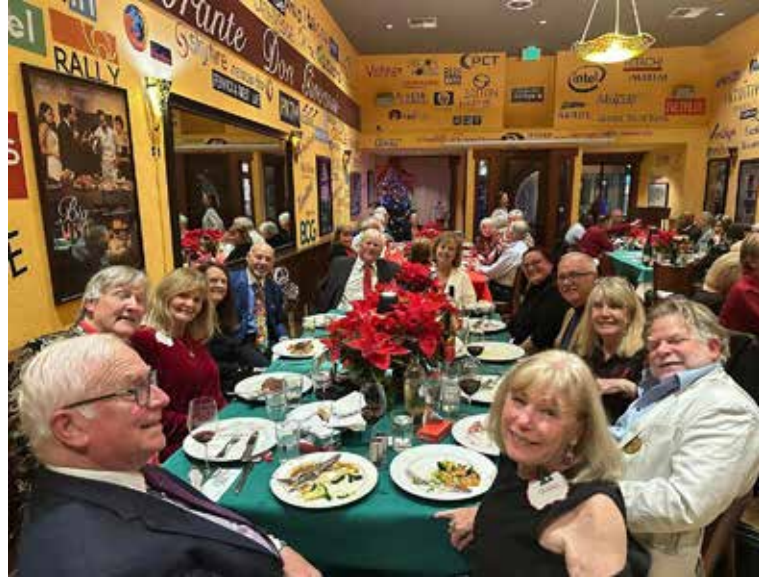
Holiday Partygoers.