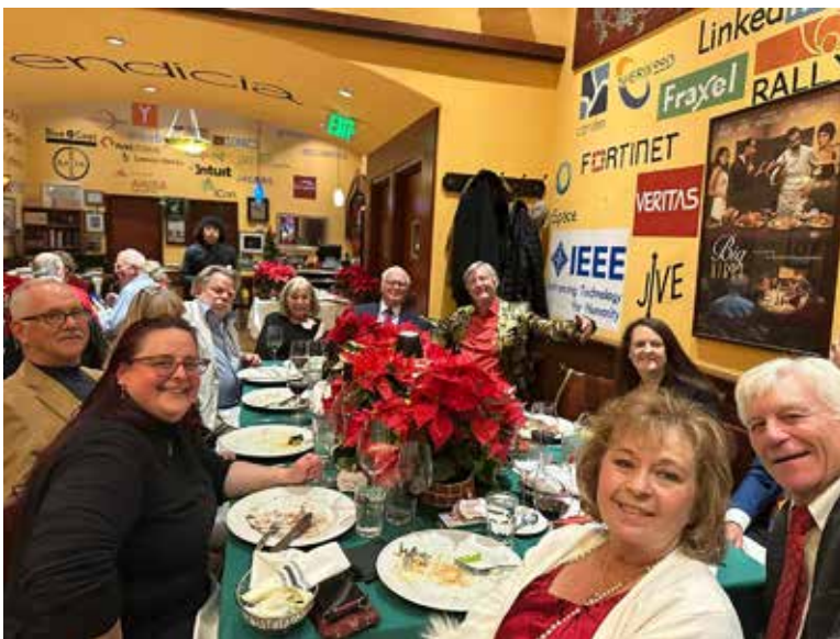
Holiday Partygoers.