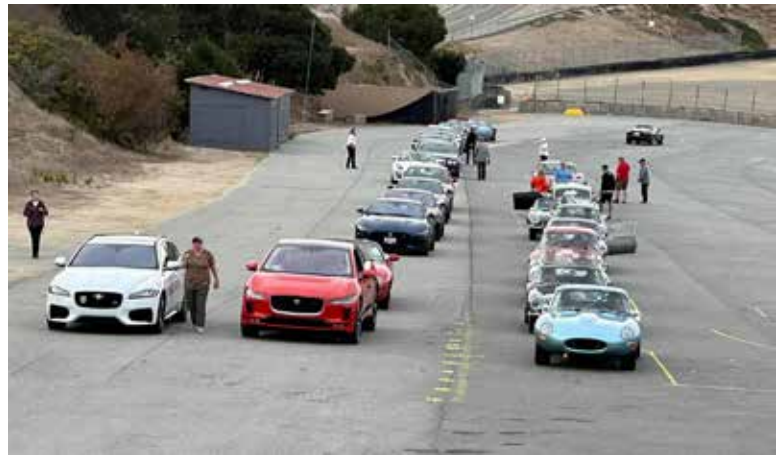
I would go to the track more often if it looked like that.