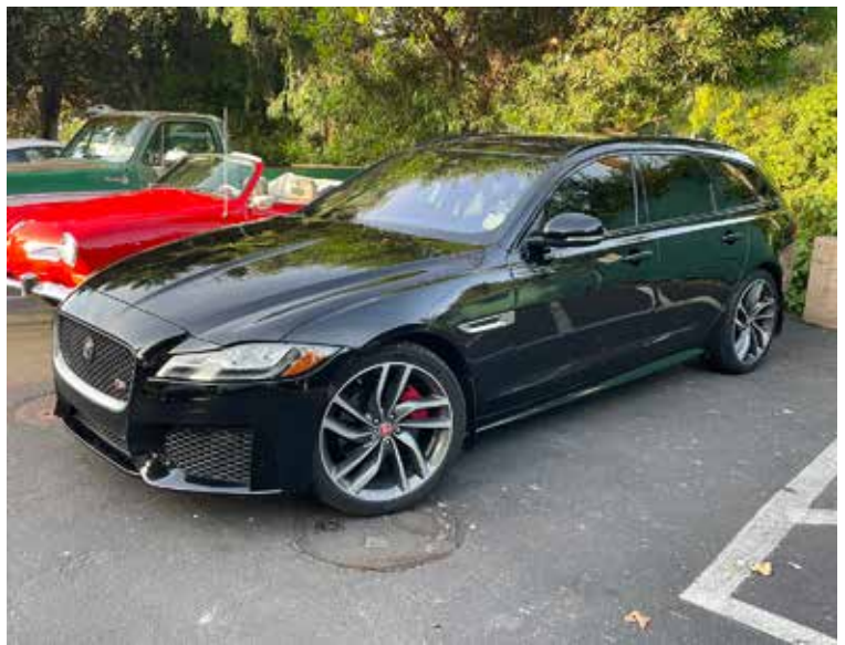
Finally spotted a black Sportbrake in the wild.