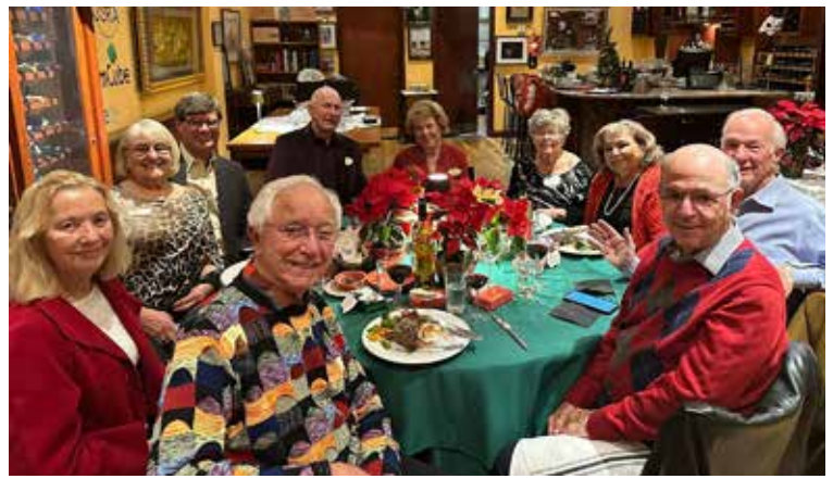
Holiday Partygoers.