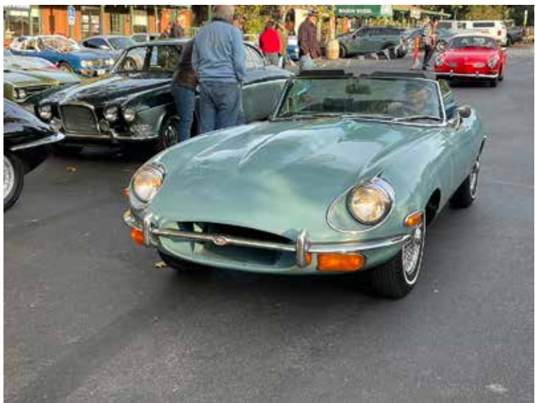
Prowling into Cars and Coffee.