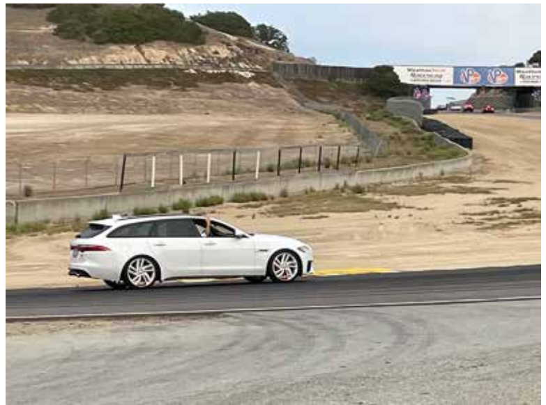
Swoosh enjoying the track. Likely only the second every Sportbrake to hit the track.