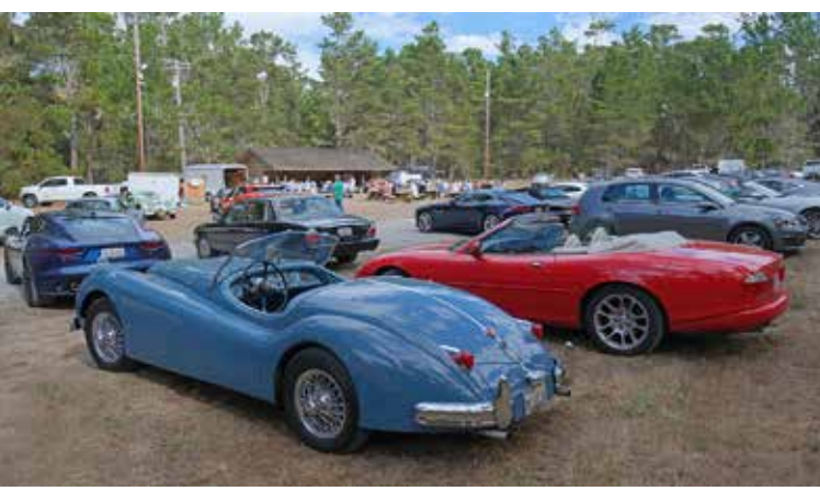
Our hidden lunch spot in Pebble Beach.