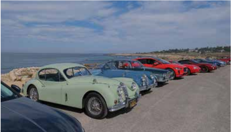
The view is almost as pretty as those noses.