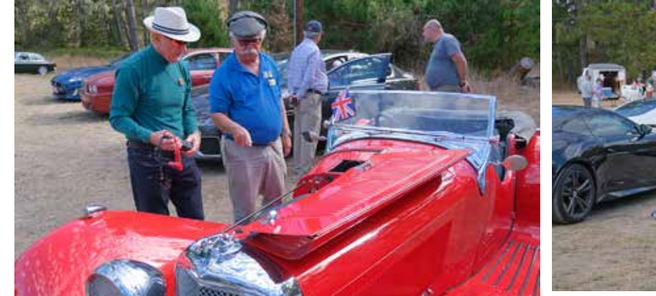
There's always something.