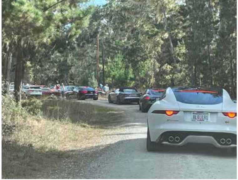
Heading into lunch.