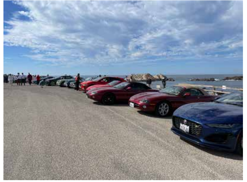
Gorgours as fas as the eye can see.