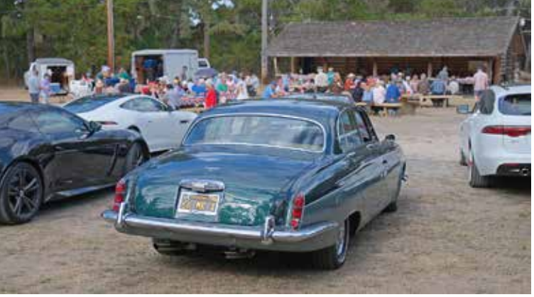
Winston watching the crowd.