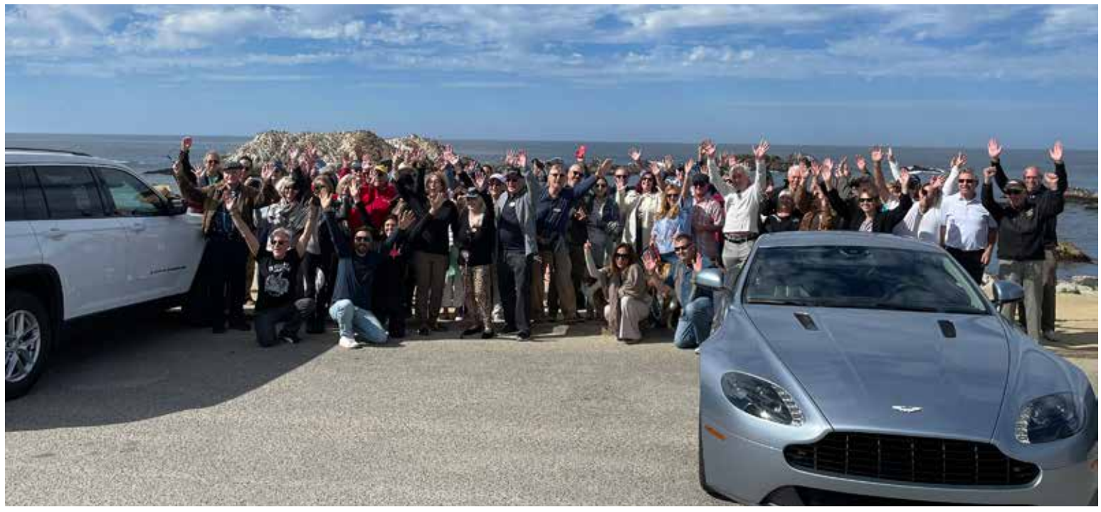
2024 Group photo by Kristan Neubecker