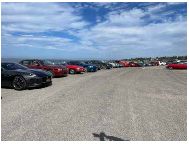
What a lineup.