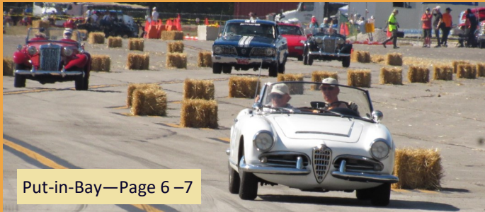
Put-in-Bay—Page 6 –7

The Official Newsletter of the Jaguar Affiliates Group of Michigan