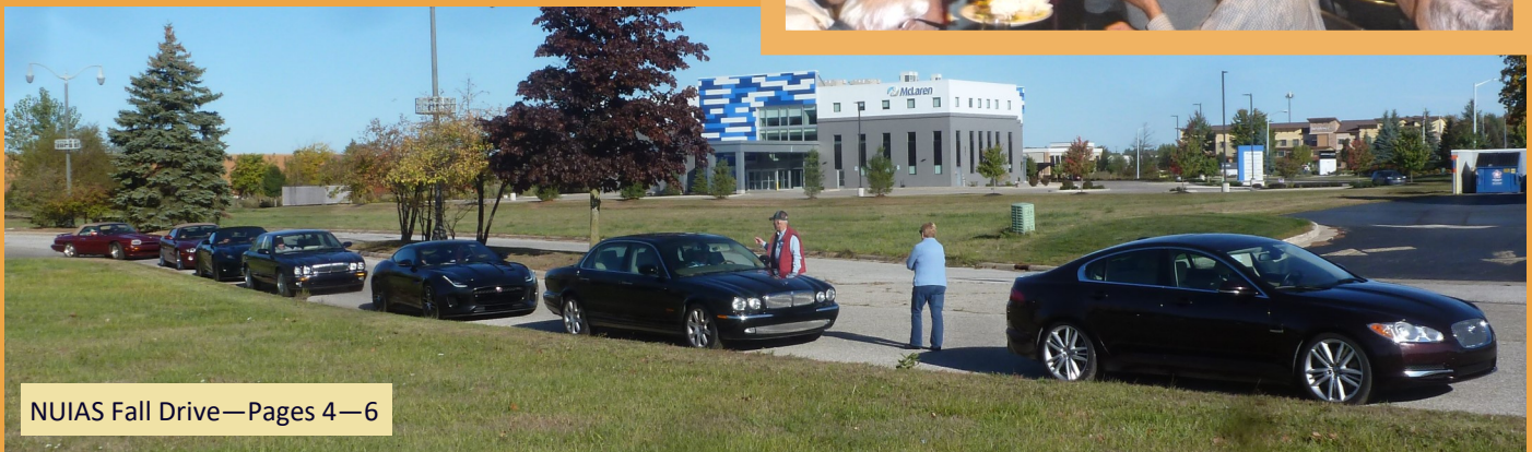
NUIAS Fall Drive—Pages 4—6