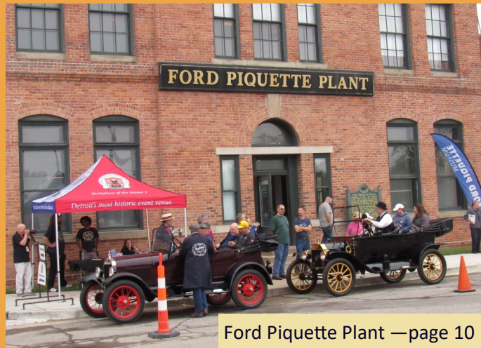
Ford Piquette Plant —page 10