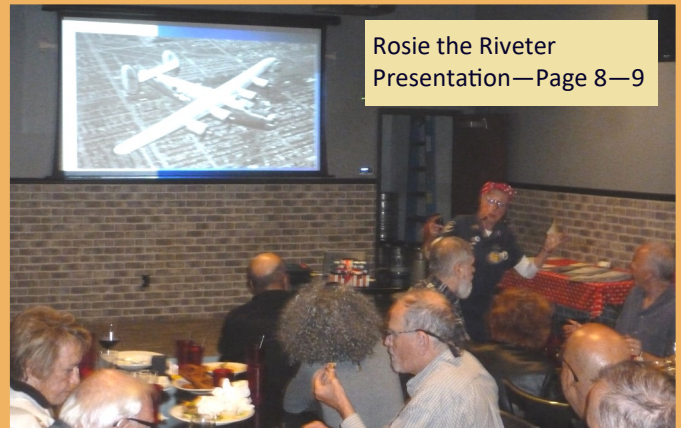
Rosie the Riveter Presentation—Page 8—9