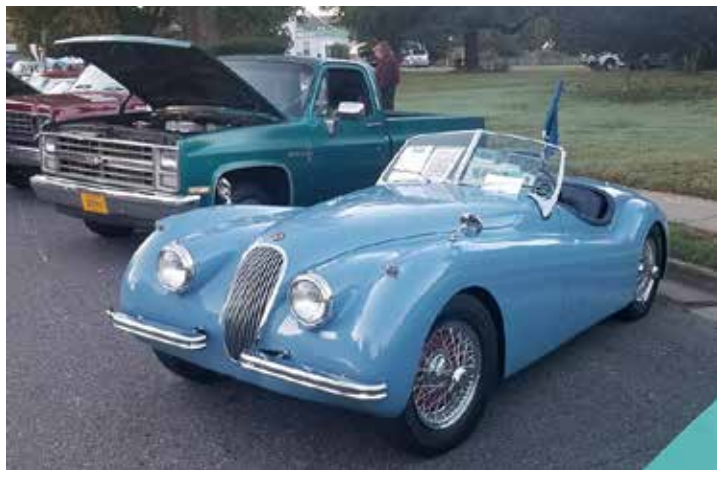
The XK120 alongside a Chevy pickup.

apologies to other white/red car owners, I don't particularly he restored it originally. care for that color combination on this particular car; 2. I *LIKE* the pastel blue/navy blue combination; and (perhaps