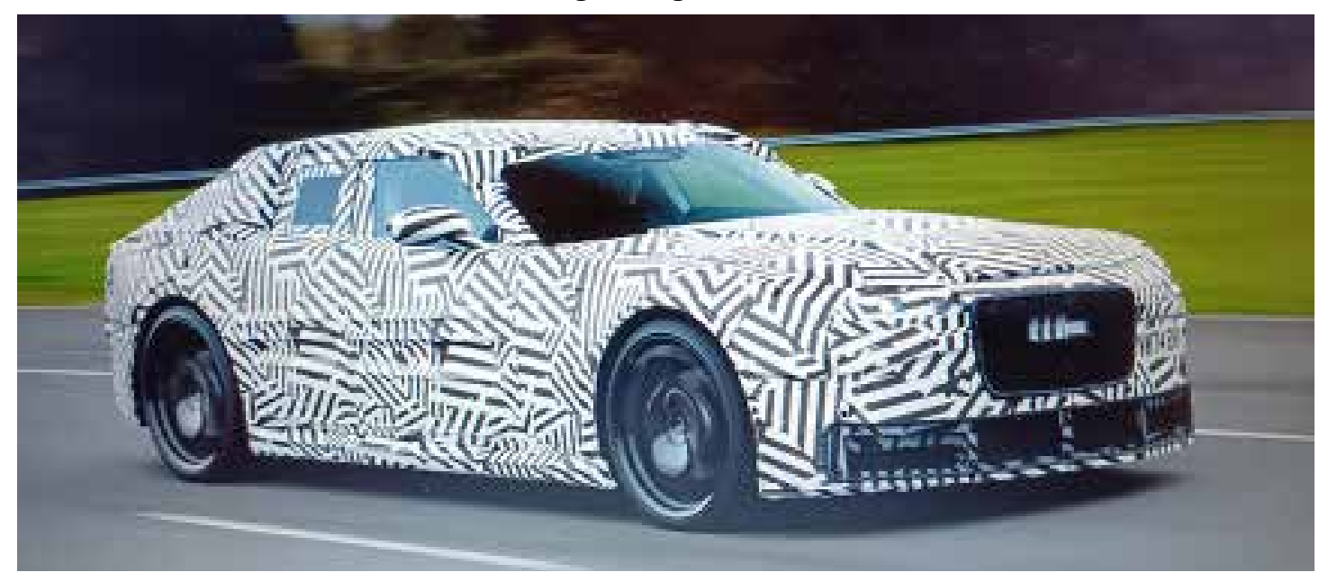
"Well ... maybe it looks better from this angle." ... Ahhhh ... Nope.