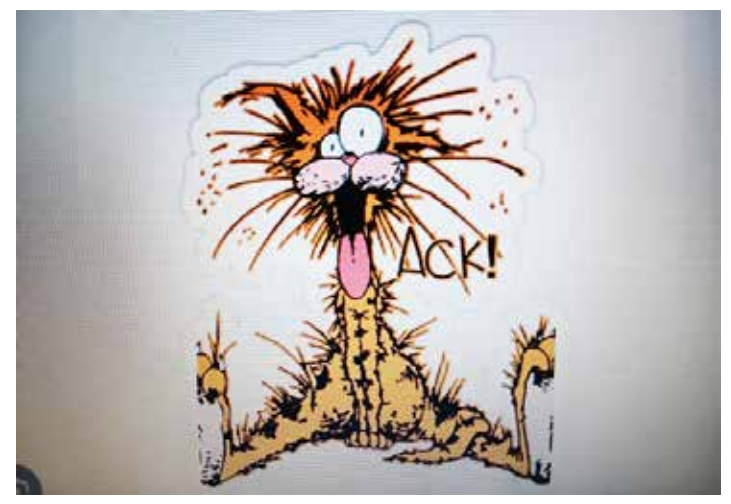
"Bill, the Cat," drawn by cartoonist Berkeley

Let us hope the car looks better with the zig-zag wrap off.