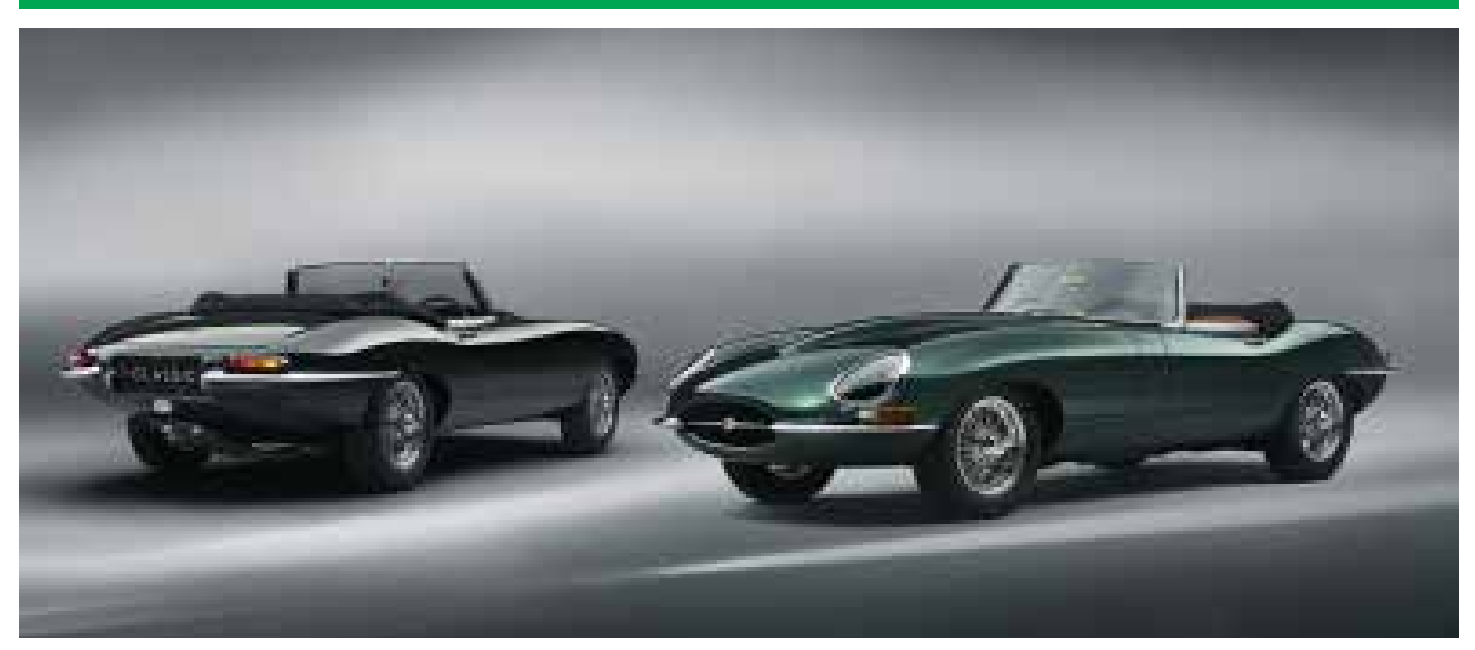
The two Classic XKE special editions.