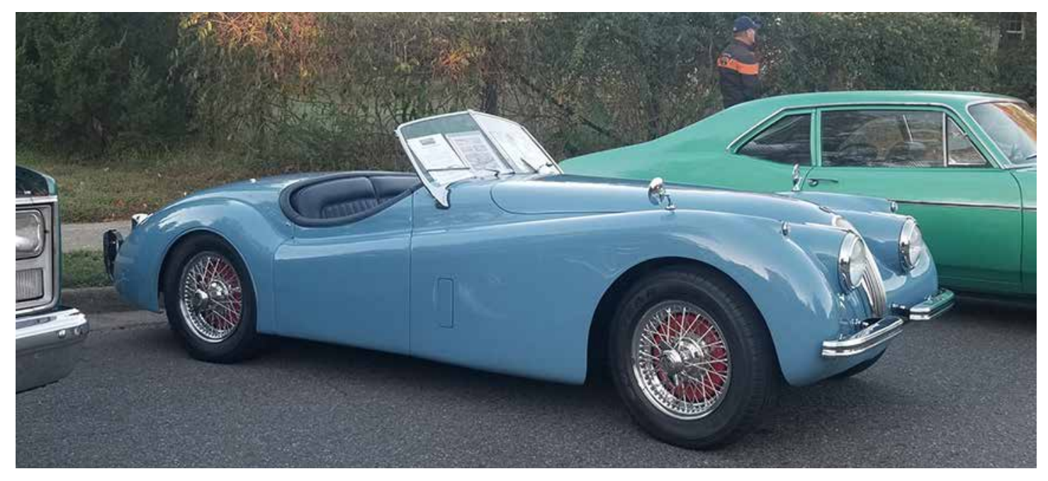
A contrast in style and purpose: George Parker's Jaguar XK120 between a pickup truck and a Chevy Nova on the streets of Bowling Green VA.

at the Farmer's Market, if they walked up to see the cars, they could easily pick mine out because it looks like NOTH-ING else there.