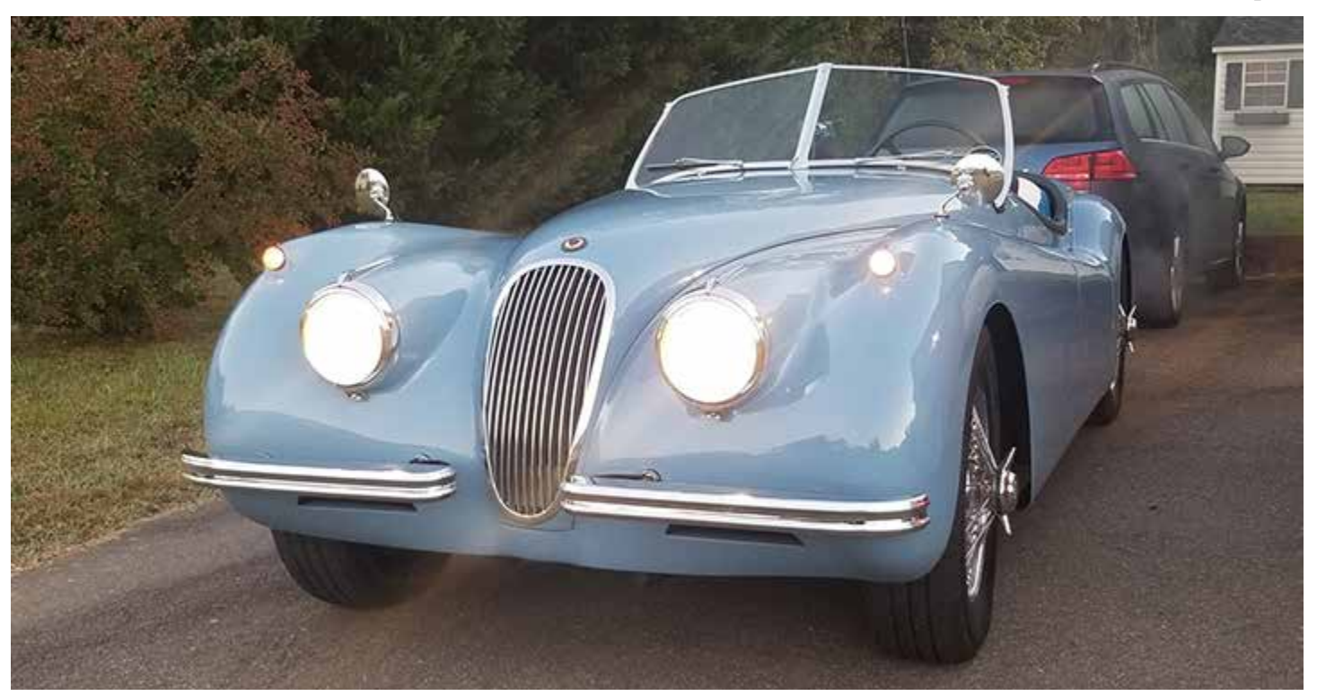
See Show, p. 10

Lights on, the Parker XK120 emerges from its snug garage to join Bowling Green's version of the Pebble Beach Concours "Dawn Patrol."