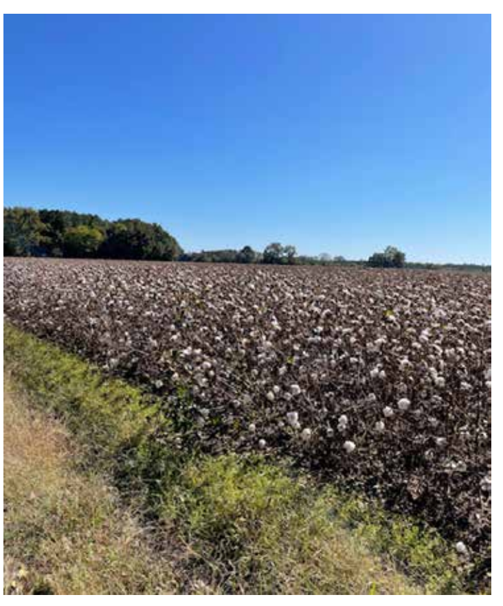
Yes, even a few cottonfields by the roadside.