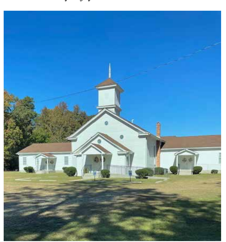
Country churches dot the roadside in rural Virginia.