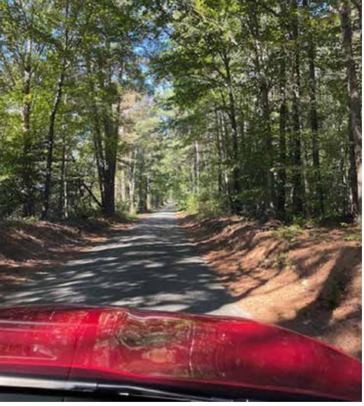
Virginia still has plenty of back roads to explore. See Surry, p. 4

So, I was going to drive around Surry. According to history when the first English settlers sailed up the James River in 1607, they first landed on the south side of the river and