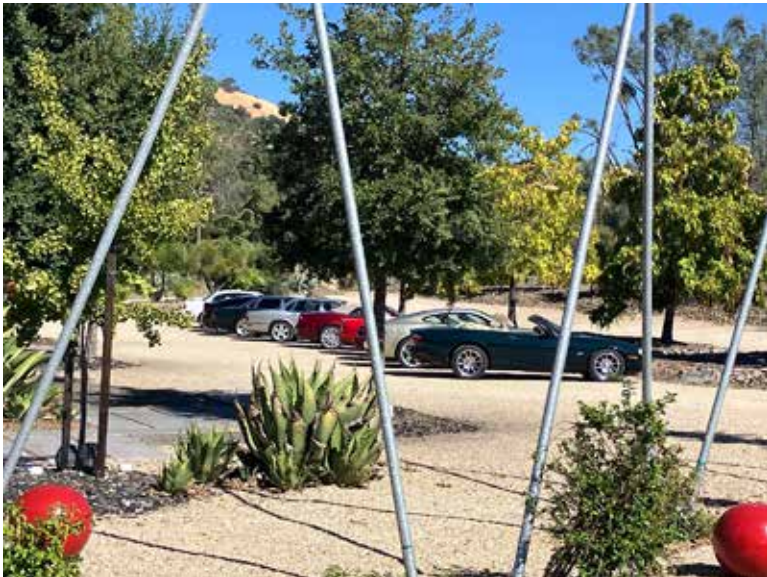
What a view.