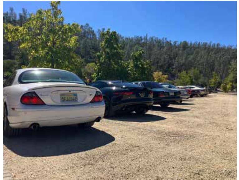
Nice butts.