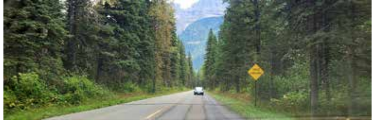
Just incredible!