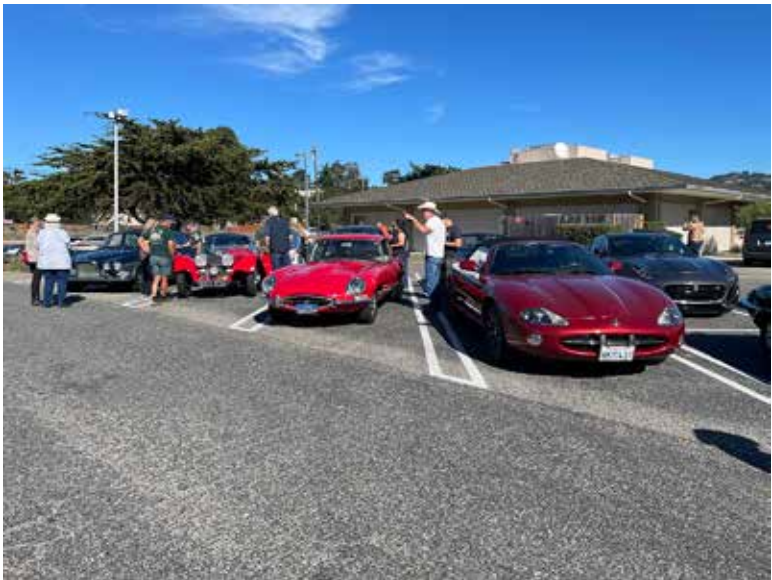
Starbucks never looked soo good.