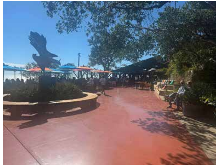
Entering Nepenthe.