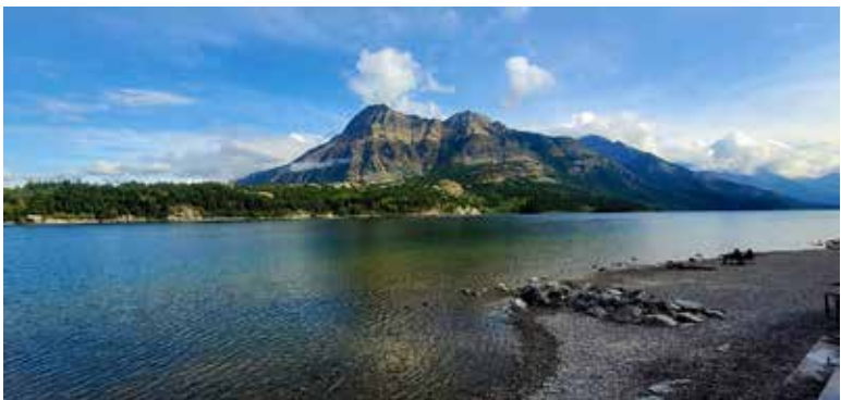
Waterton Lake National Park.