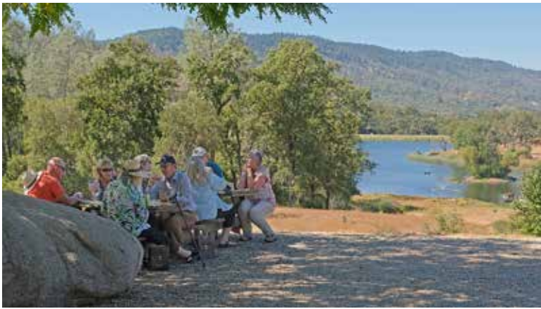
Lunch at the Lake.