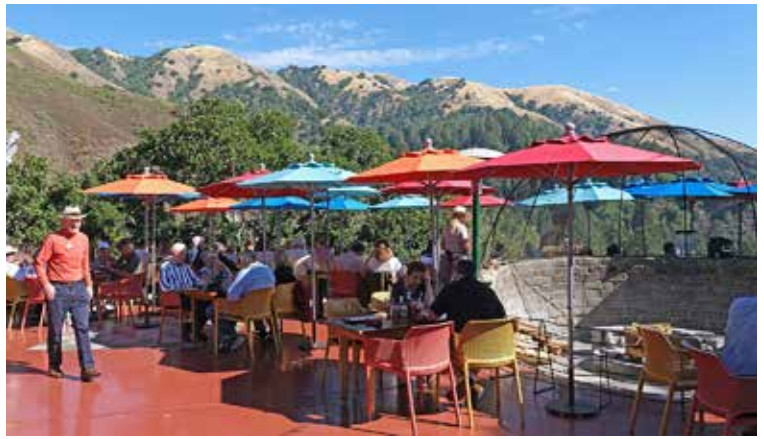
Ahhh Nepenthe.