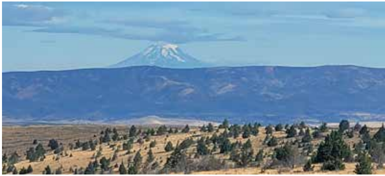
Big Sky country for sure!