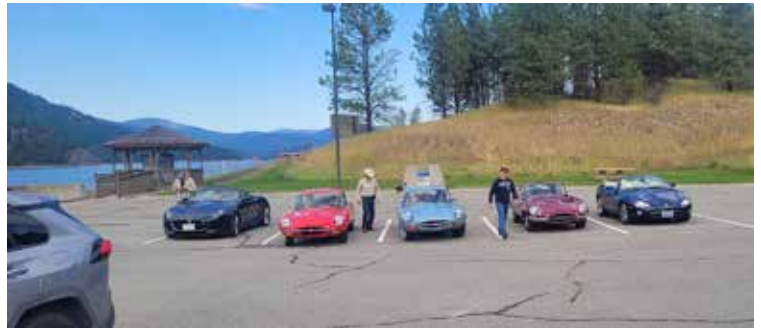
By Lake Koocanusa.

Link to blog: https://bsolii.blogspot.com