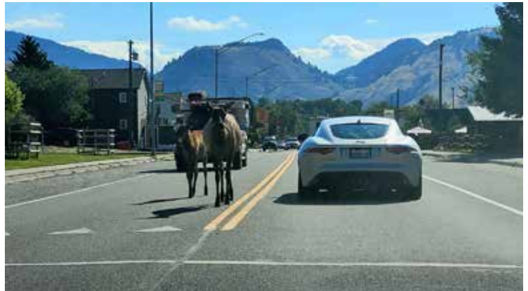
Not your usual traffic.