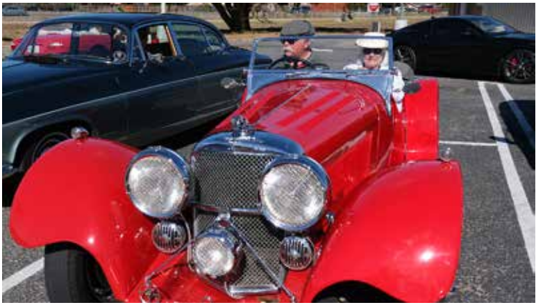
1963 SS100 arrives safely from LA.