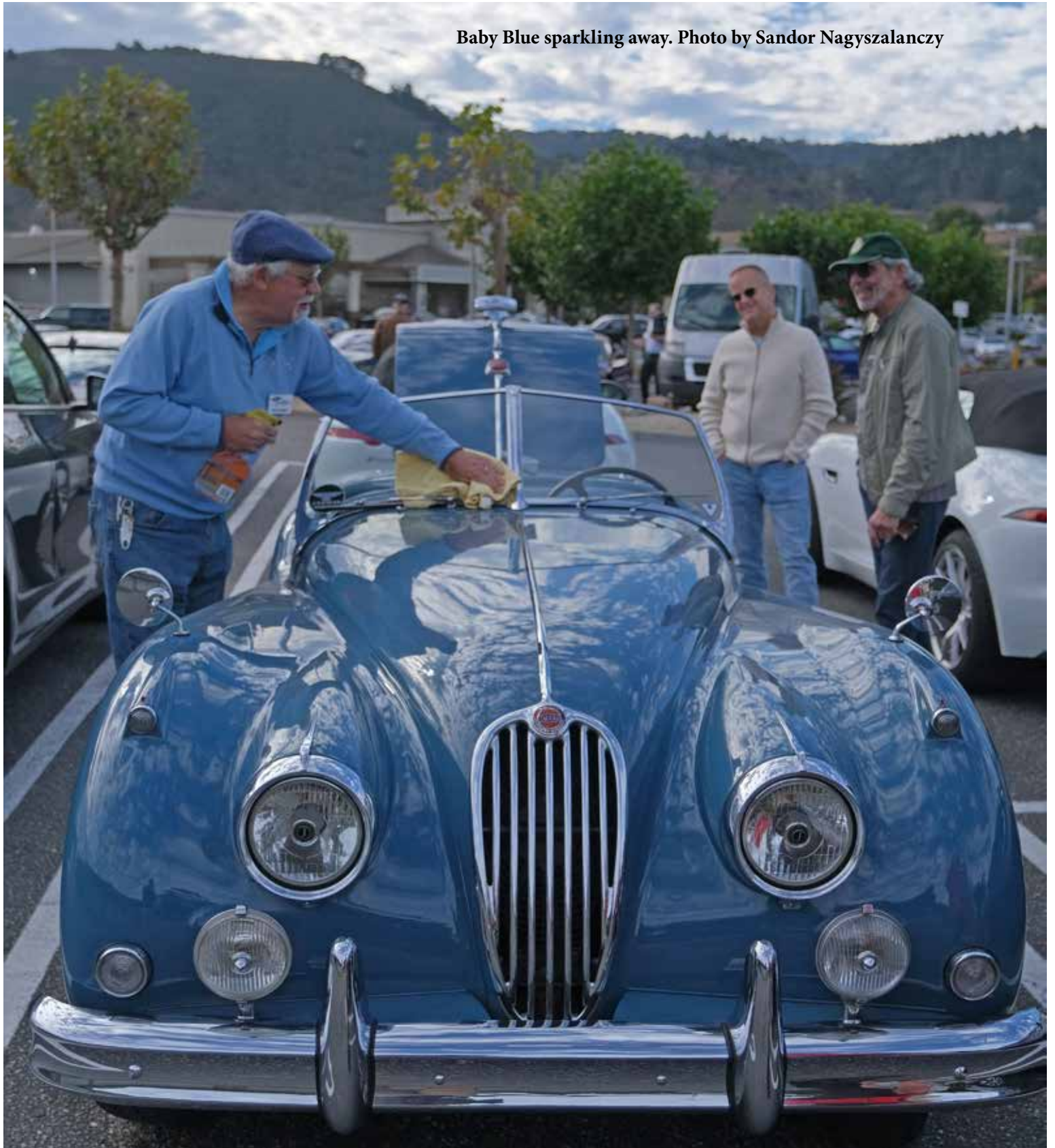
Baby Blue sparkling away.