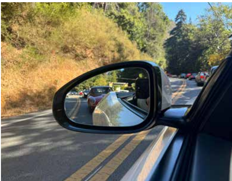
Not a bad view either way.