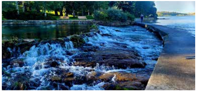
Giant Springs.