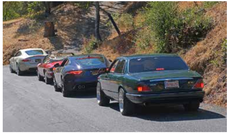
Purrrrrty lineup.