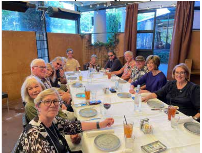
Lunch at La Toscana.