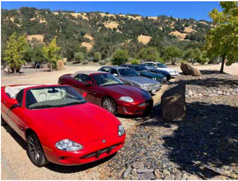
Lookin grrrrreat!