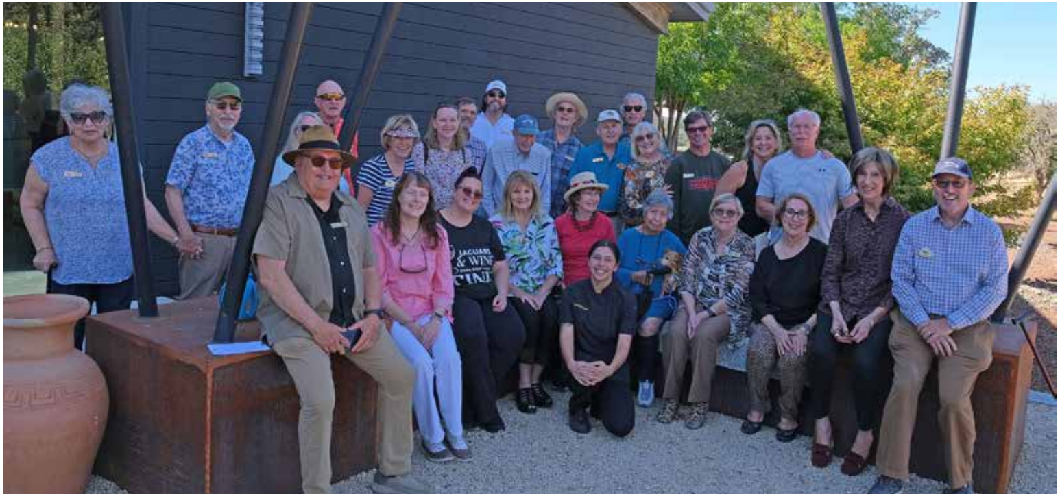
The JAG bunch at Maxville Winery.