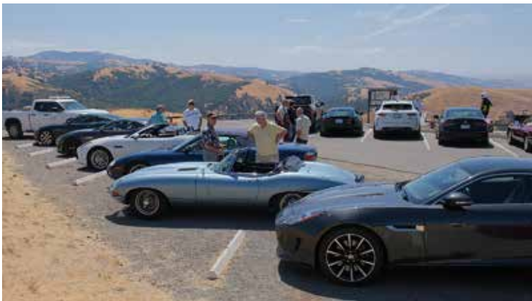
Mighty Purrrrrrrrty!