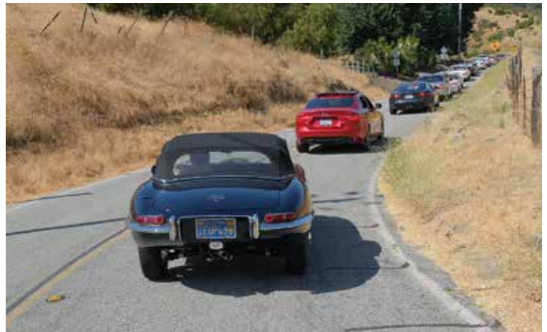
That's my kind of traffic!