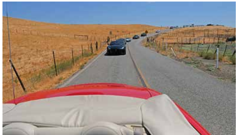
What a lineup.