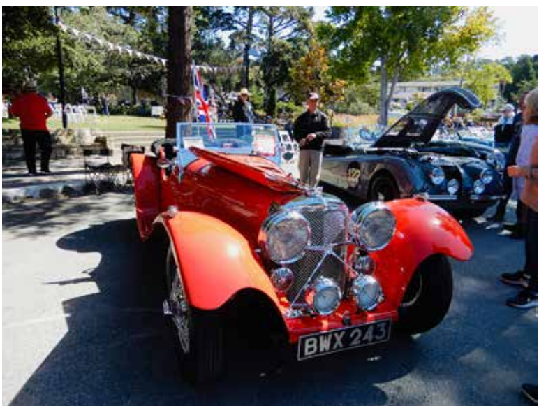
Phil Endliss admiring the DeWitt's SS-100 in Carmel