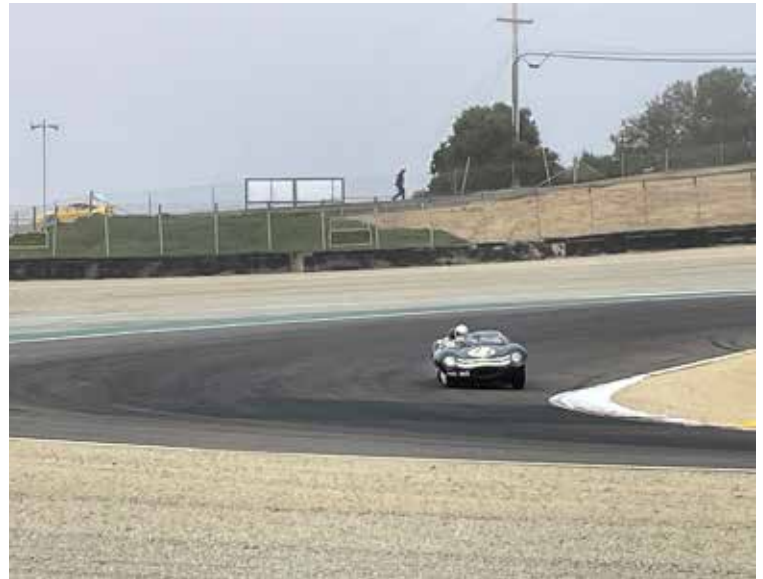
Pinching myself watching multi-winning XKD502 come through turn 5.