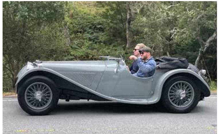
The 1936 SS100 from Singapore on the Tour d'Elegance before the Pebble Beach Concours.