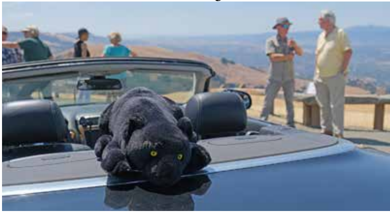
Watch out for cats on the prowl.