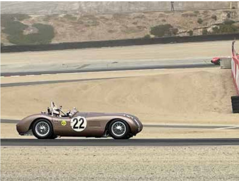
It's true, I really did see Jenson Button race XKD018 in real life.