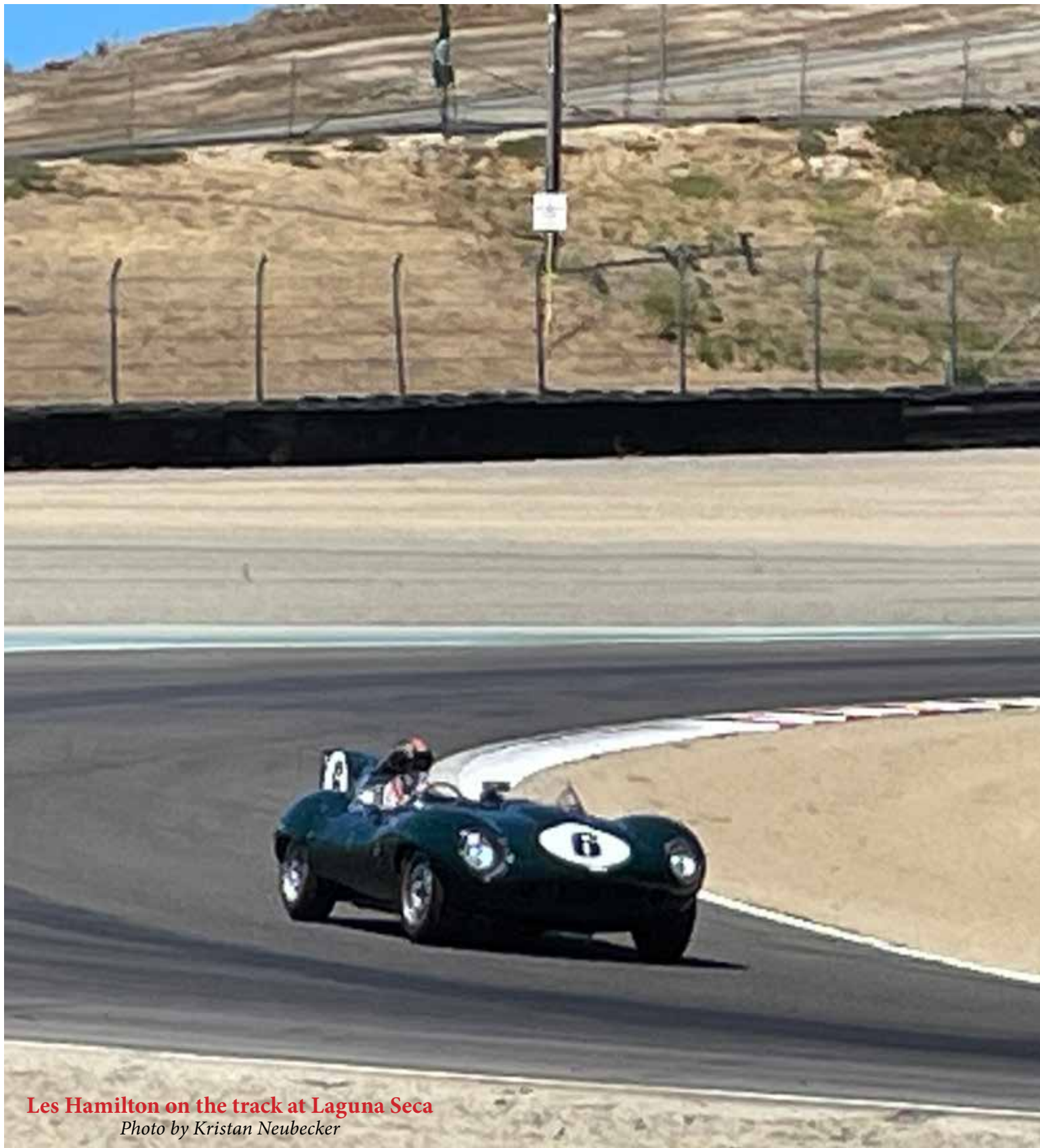
Les Hamilton on the track at Laguna Seca