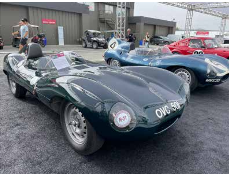
The first D-Type prototype next to the 1956 LeMans winner.