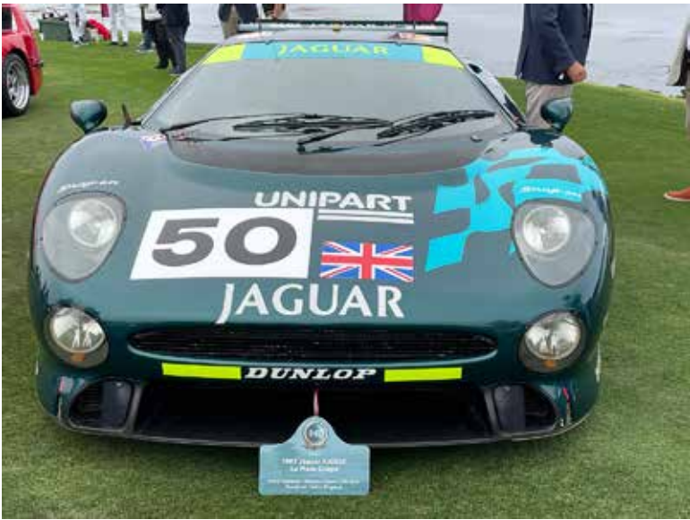
_The father of GT1 racers_ and Jaguars final LeMans podium winner.