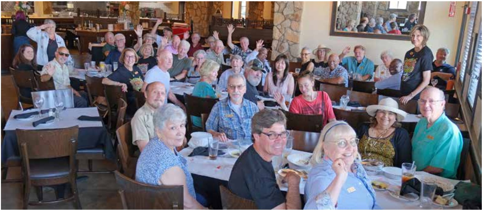
A good lookin lunch bunch.