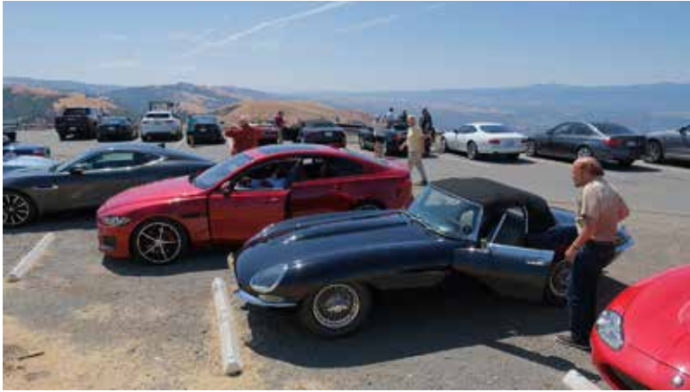
I have to say the view is better in the lot!