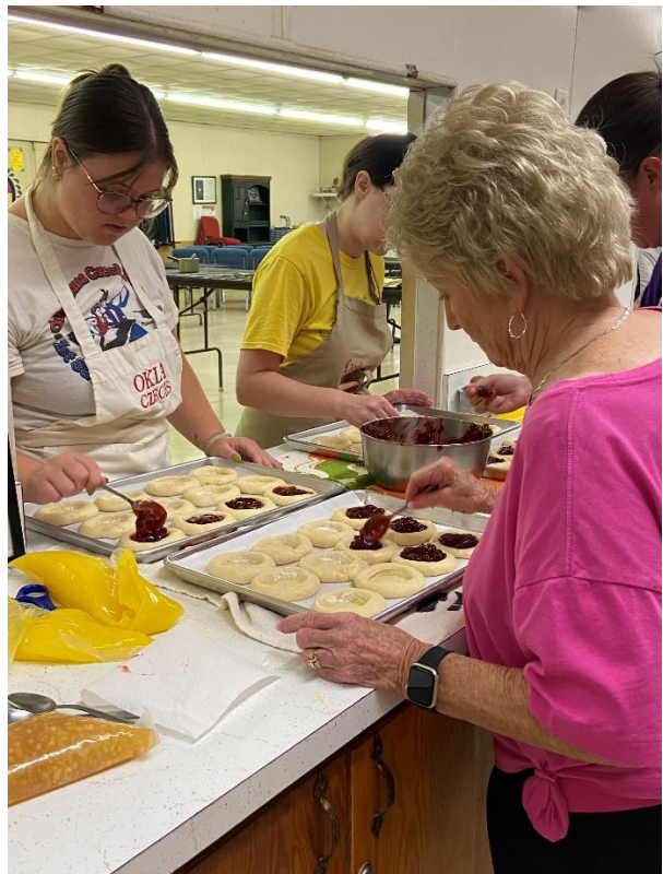
Filling the Kolaches.