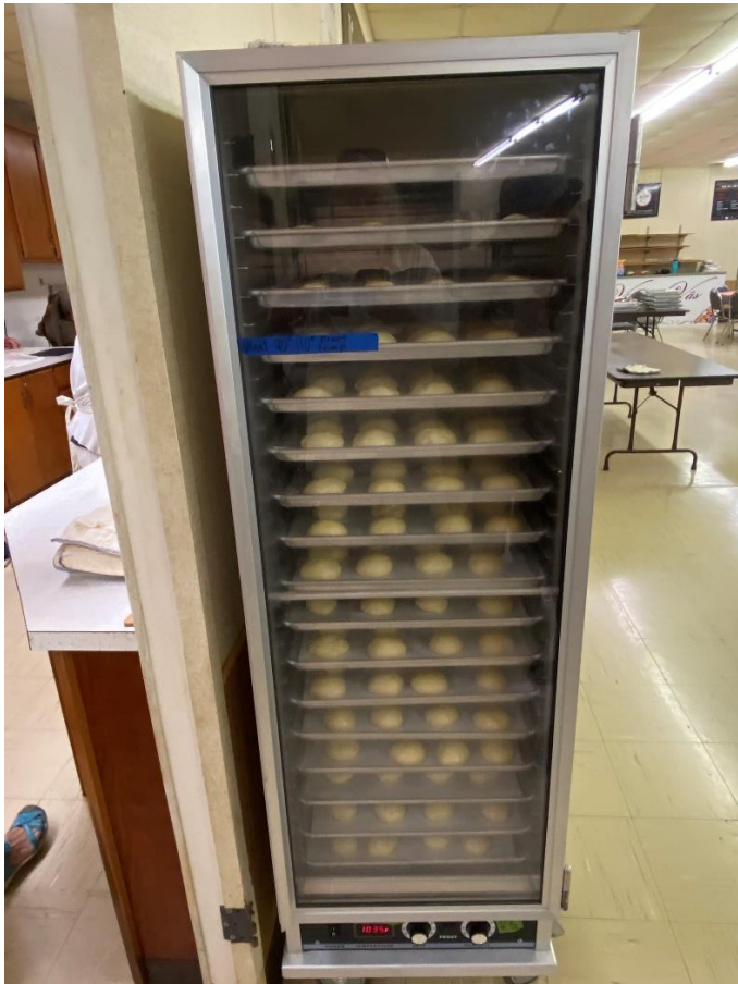
Kolache warming oven.

Aspen said they prepare the 25 pounds of flour, plus sugar, milk, butter, and spices for the Kolaches in large mixers, each enough to make at about 40 dozen. Then the flour mixture is prepared and set aside to rise. After an hour, they withdraw several dozen round handfuls of the flour mixture (about the size of a golf ball) and set aside in a warm oven to rise again, which takes about another hour.