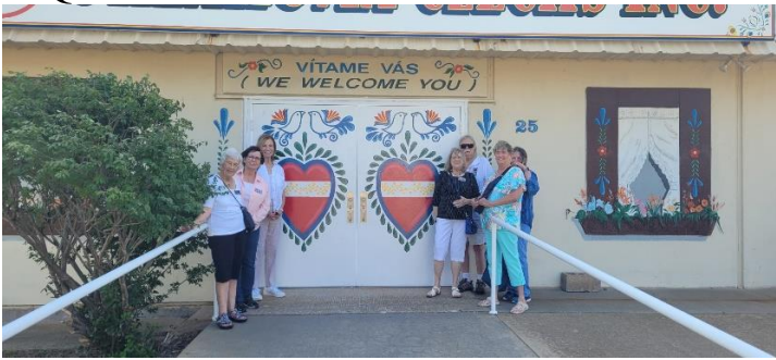
Entrance to Czech Hall.