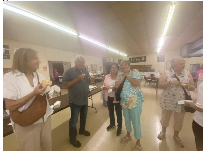
The group getting their fix on a free Kolache sample.

As mentioned earlier their goal was to prepare 2,000 dozen Kolaches for the festival. Think about that; that is 24,000. We had been promised a sample of whatever flavor we desired. I expected the sample to be a simple bite size. Instead, everyone was given a full size Kolache.