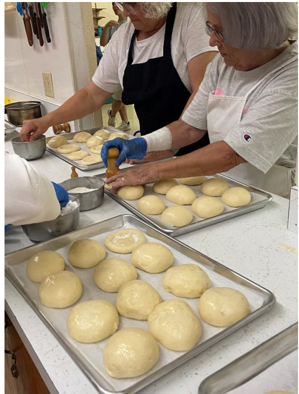
Kolaches being flattened to receive filling.

At the end of the second rising the ladies then place them on cooking pans and flatten them out and with a special wooden tool, they compress the center of each for adding the special flavoring mixture. She said they have apple, cherry, pineapple, strawberry, apricot, lemon, poppyseed (which to me looked like blueberries) and cream cheese.