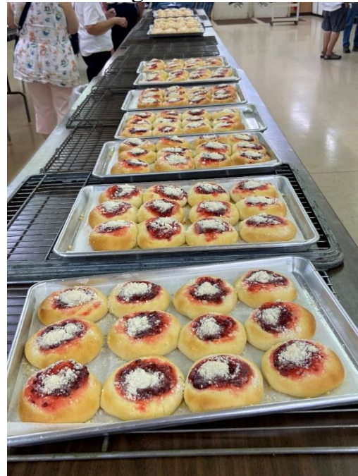
Kolaches ready to eat.

Janice began by showing a dozen or so large tables where the cooked Kolaches were cooling.