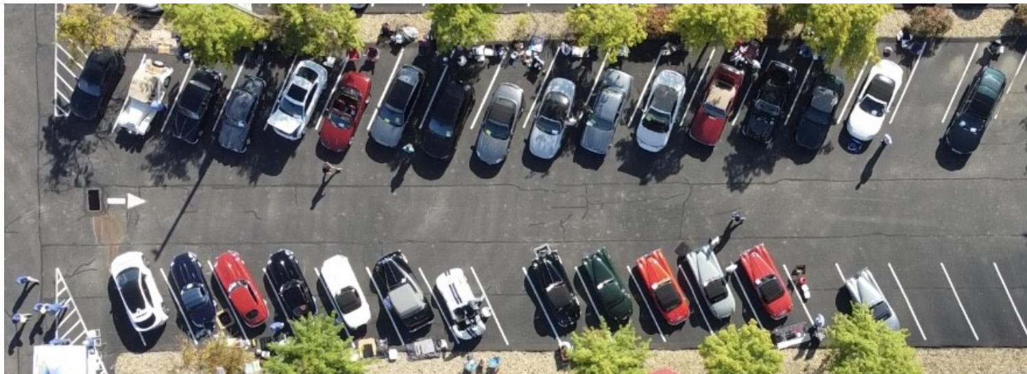
Cars lined up at last year's Pittsburgh Concours d'Elegance at Fox Chapel Yacht Club.