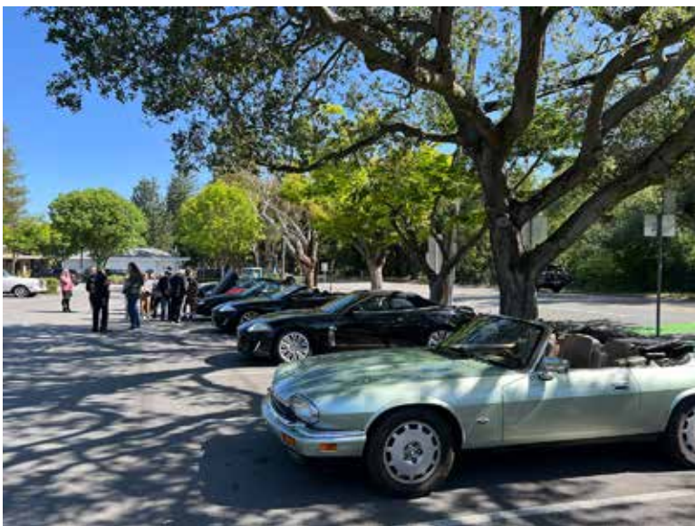
Purrrrrrrrrrrty cats!