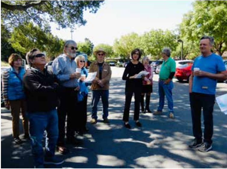
Drivers meeting.