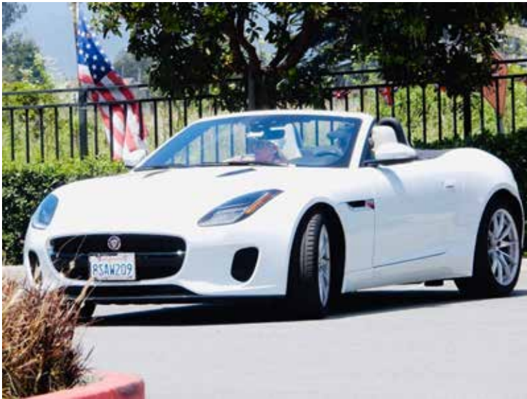
Fabulously ferocious.