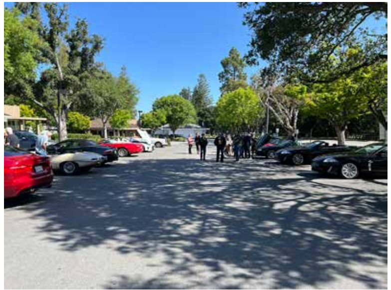
My kind of parking lot.