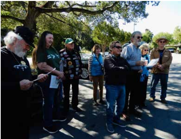
Instructions for the new route.