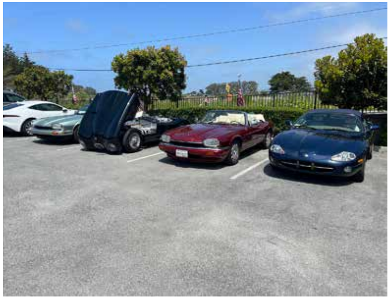
Sleek and smooth even while resting.