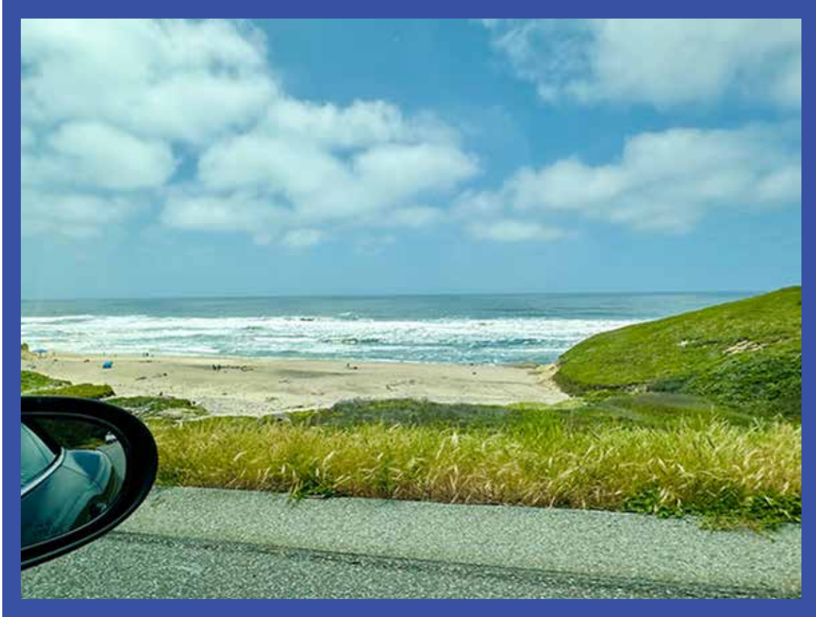
Like the Mamas and Papas said, "California Dreamin_".