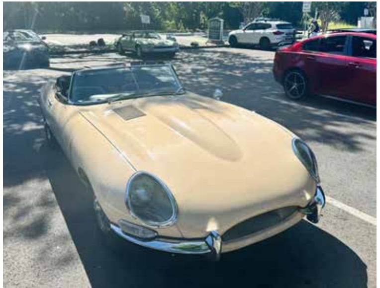
What a beautiful bonnet!