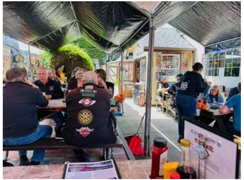
Lunch at Cameron's.