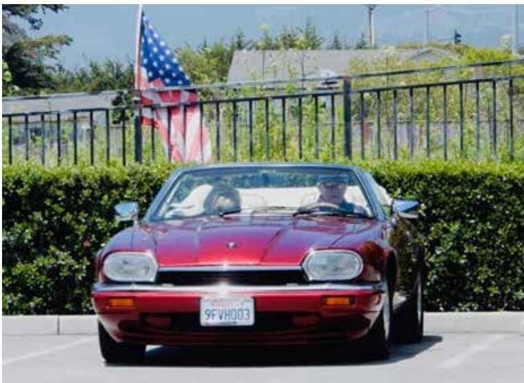
The Smedlys enjoying a glorious top down day in their beautiful 19xx XJ12.