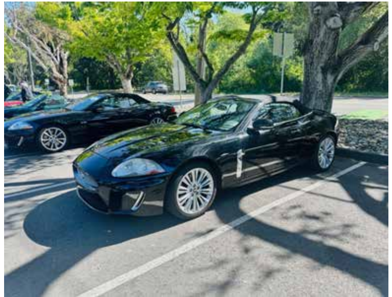
The slogan may be, "double your pleasure, double your fun" but I'll take a couple of XK's anyway.