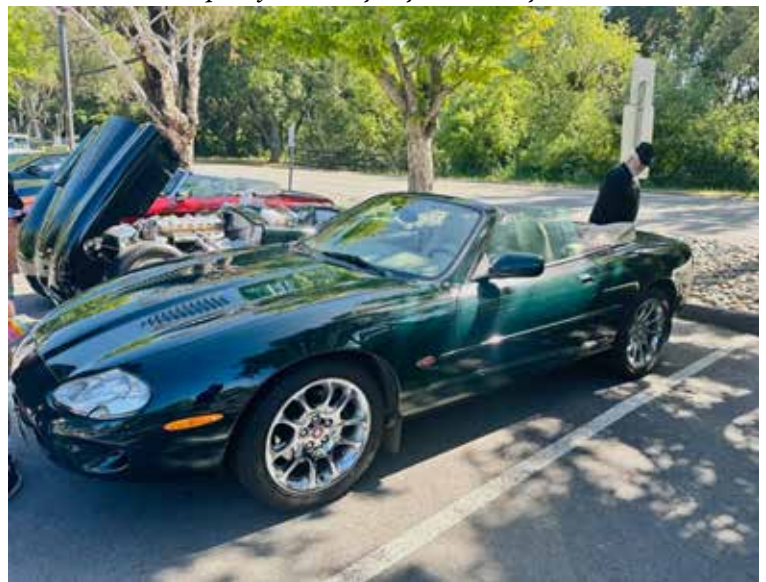
There's always something so spectacular about BRG in the sun.