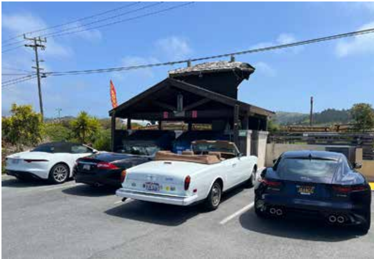
Some good lookin' rears.