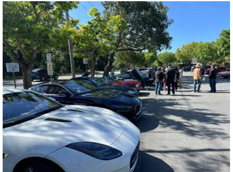
There's nothing like a row of Jags in the morning.