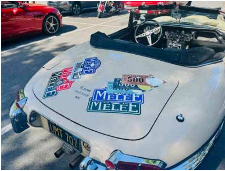
Don't you wish cars could tell stories?