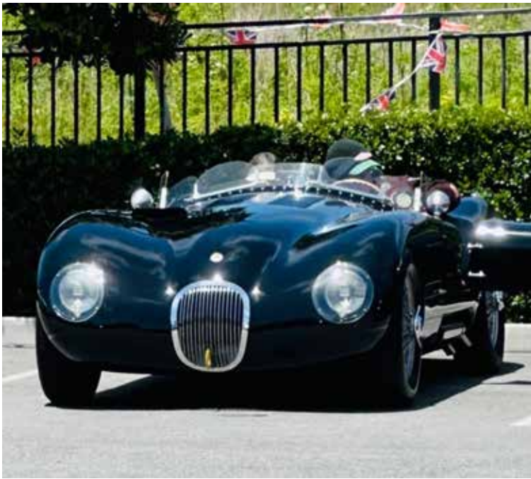
It's always a grrreat day when the Barrys arrive in the C-Type.