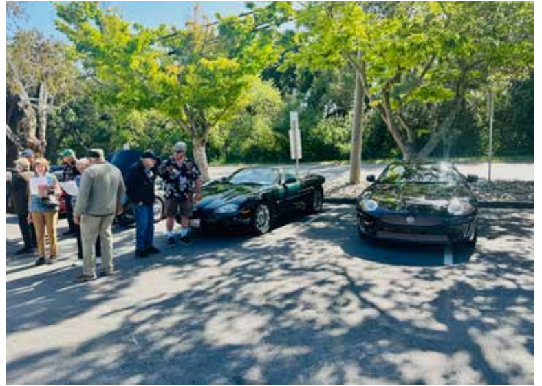
More meetings should take place around Jags.