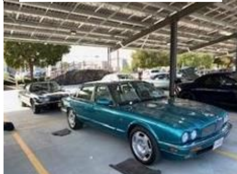
Brian Blackwell's 1995 Teal XJR Saloon