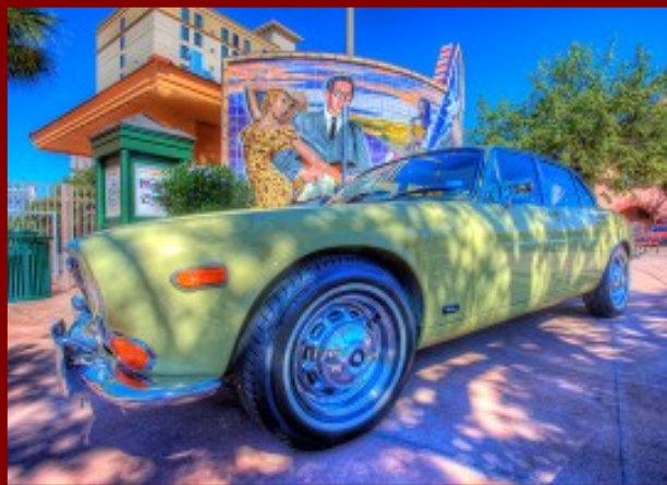
Victor's yellow 1971 XJ6 aka "Grandma"