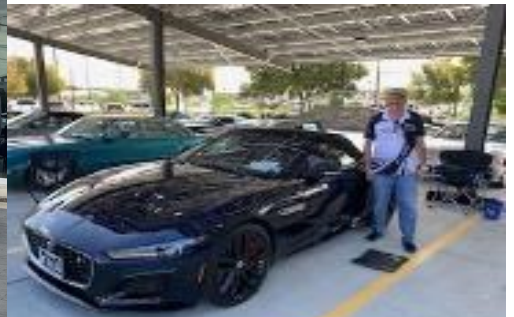
Manny Jimenez's 2021 Portofino Blue F-type