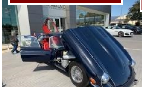
J.J. Keig's 1969 Blue E-type Coupe