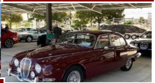
Don Snyder's 1965 Maroon S-type Saloon