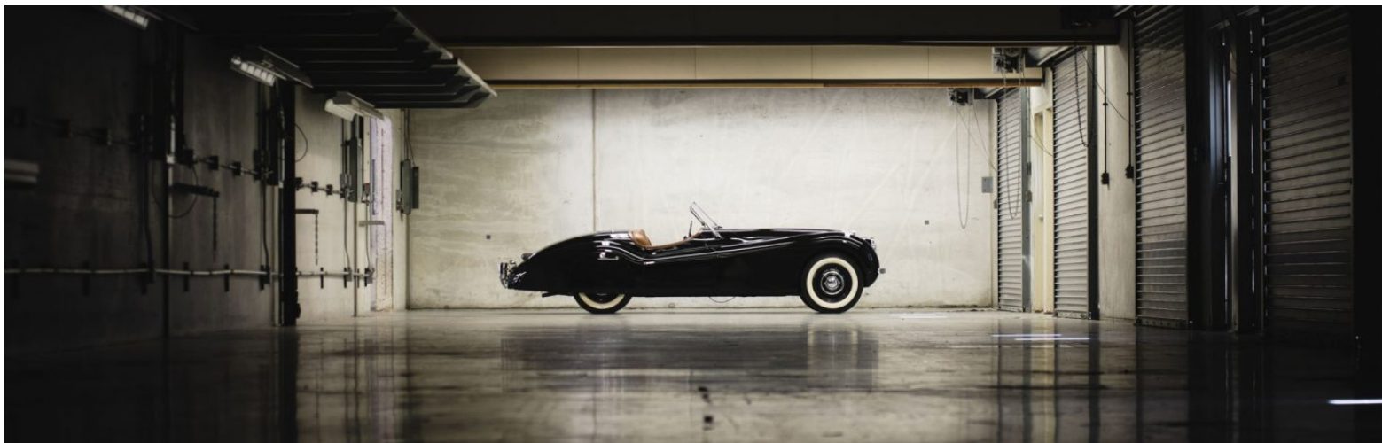
Clark Gable's XK120 'Indy Car' Only 6,500 miles on the register.